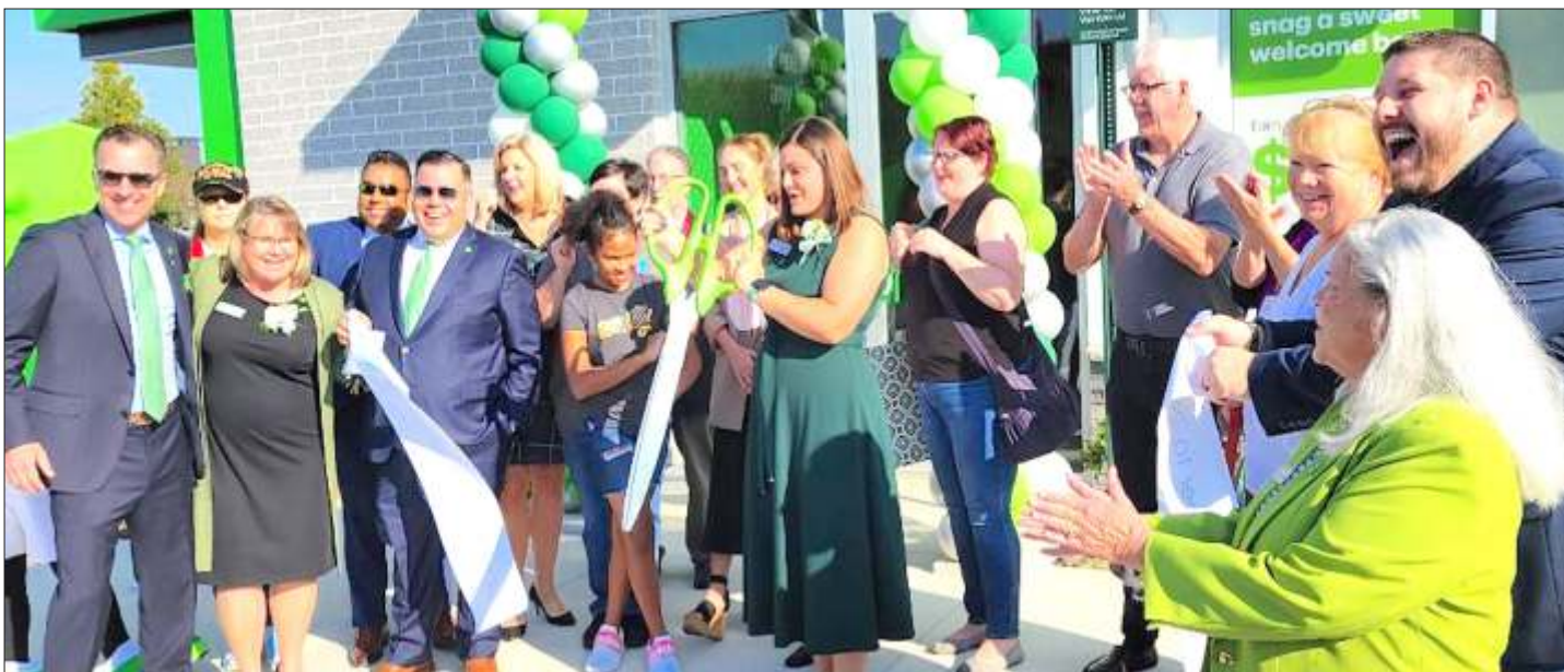
Ribbon Cutting at TD Bank in Lady Lake Crossings Plaza