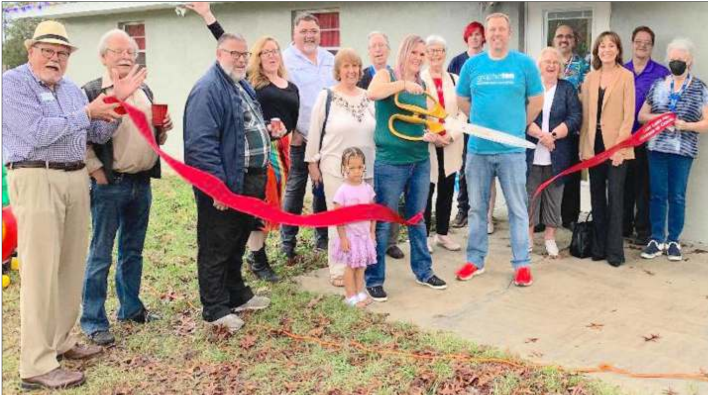
Ribbon Cutting for GraphicTen/ CM PC Repair in Belleview FL