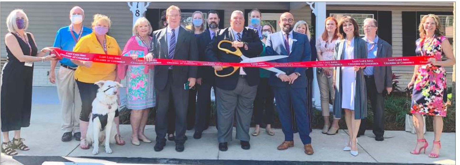
Lady Lake Chamber held a ribbon cutting for Hiers Funeral home. As you can see it was well attended.