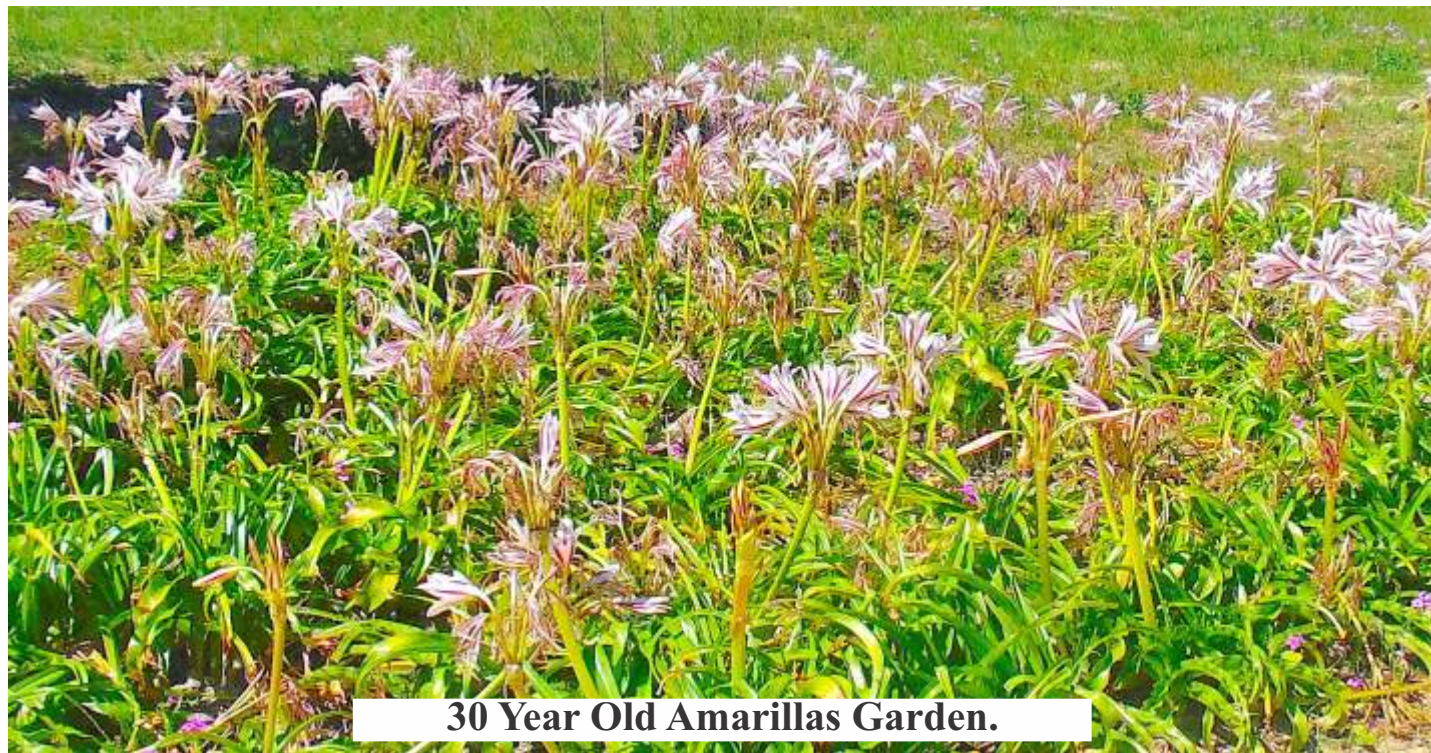
30 Year Old Amarillas Garden.