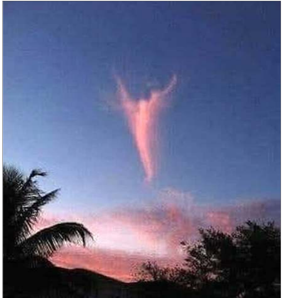
Where did this picture come from? I don't know where it came from but it is a sign! It a beautiful picture to display this time and date.

so gallantly streaming? And the rocket's red glare, the bombs bursting in air, Gave proof through the night that our flag was still there; O say does that star-spangled banner yet wave O'er the land of the free and the home of the brave?