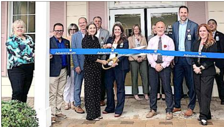
Advent Health Home Health celebrated the opening of their new office in Lake Sumter Landing with a