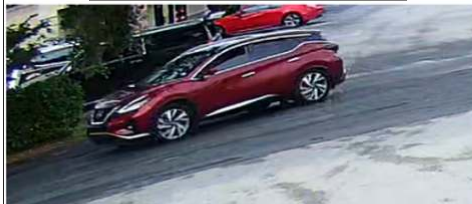
LLPD Investigates Shooting: Identify of Shooter's Car

On 5/19/2026 at approximately 5:14 p.m., a maroon Nissan SUV (possibly a Murano) entered the parking lot of Affordable Lock, located at 356 S US Hwy 441, Lady Lake, FL. An unknown Black male exited the SUV, ran to the roadside, and discharged approximately seven rounds from a handgun toward a silver sedan believed to be a Hyundai Elantra.