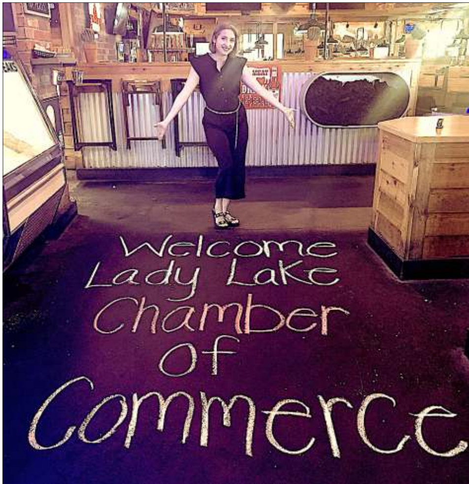
The may networking lunch was held at quality networking. Pictures of the Texas roadhouse in Lady Lake. Attendees winners of the door prizes on page 8.. enjoyed a delicious menu, and lots of