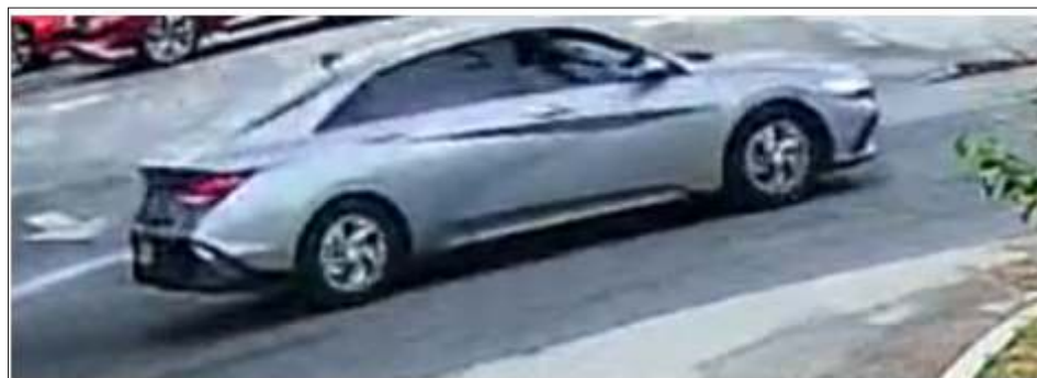
LLPD Investigates Shooting: Identify of car being shot at