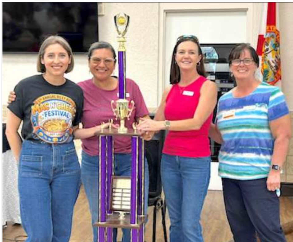
Last Month we had missed a picture of the Best Booth at the Cheese Festival we missed a picture of the best Booth it was the IDW “The Big Cheese Best Booth”