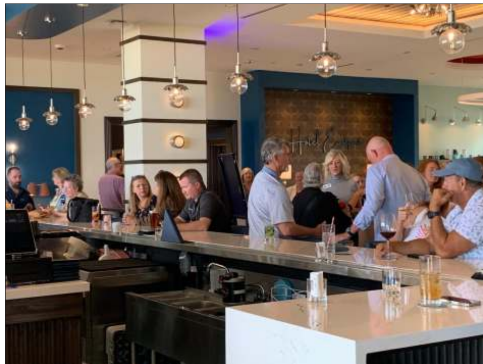
Hotel Eastport held Lady Lake Area Chamber After Hours

“After such a strong turnout and positive