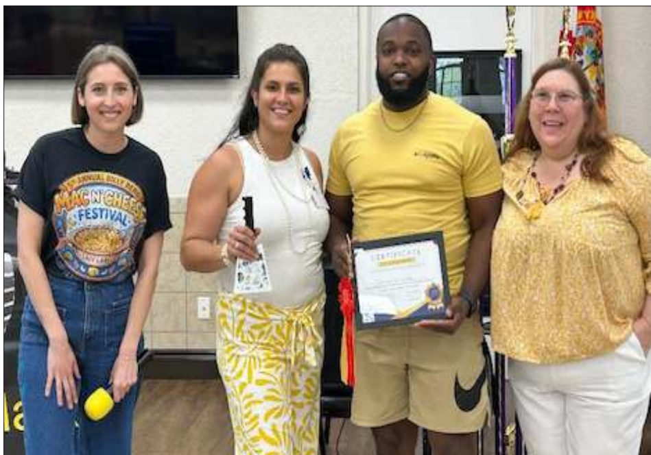
Cypress Care Center came in second place people's choice at the fifth annual Billy Berg, mac & cheese festival and business showcase