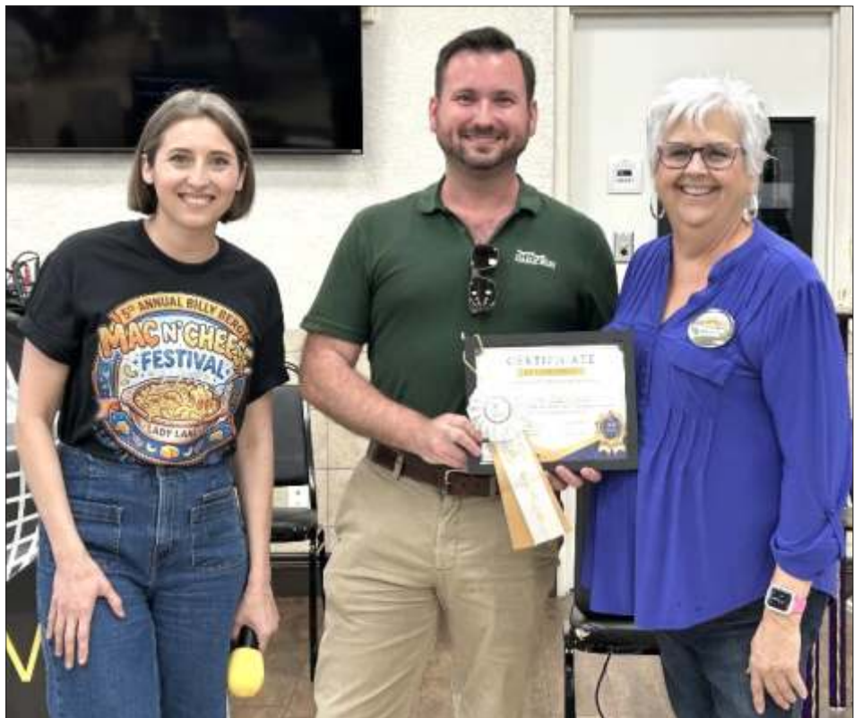
The Daily Sun came in third place for people's choice at the fifth annual Billy Berg, Mac & cheese festival and business showcase