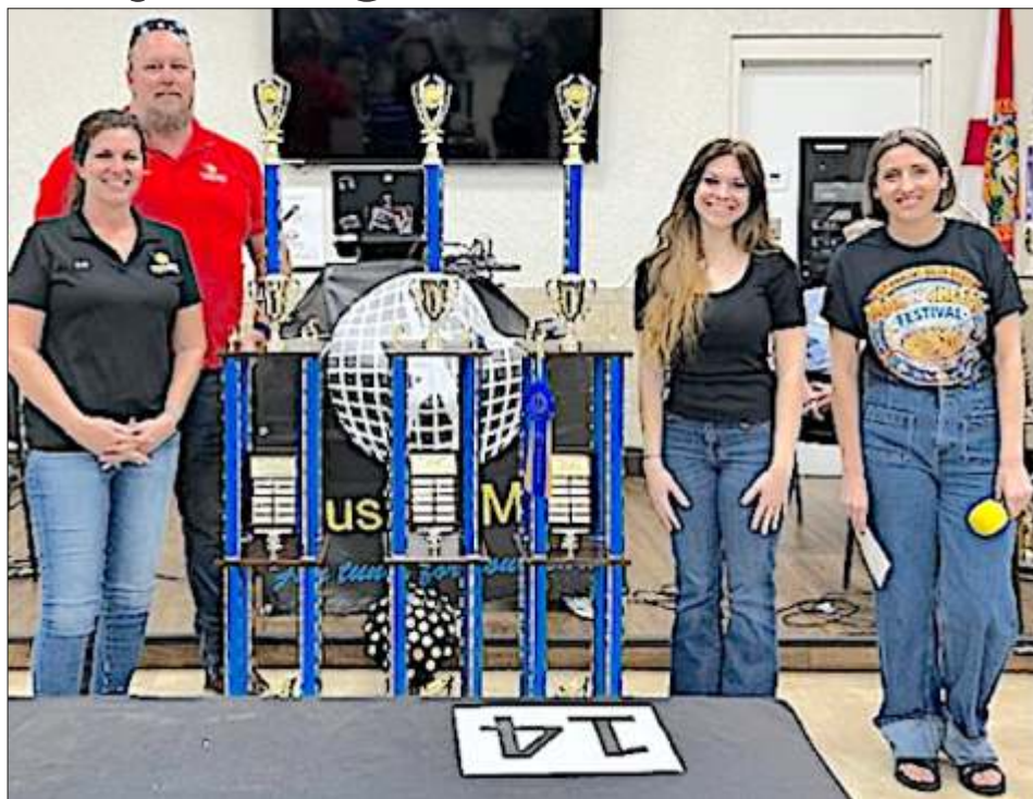
At the fifth annual Billy Berg mac & cheese festival and business showcase Eaton's Beach took home 3 1st Pl. trophies. First place from People's choice. First place from judges choice. And first place from kids choice.