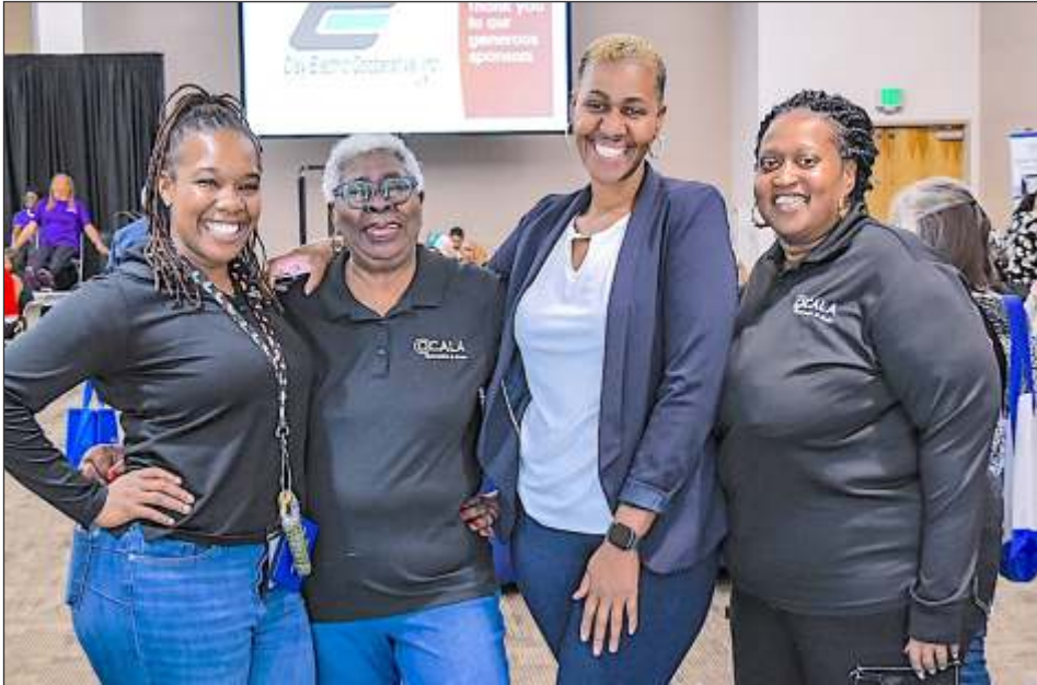
The Parade was an over whelming success. This picture is some go the Ocala Recreation and Parks crew that worked putting the Information fair on one of many you can find on Pages 6 & 7.