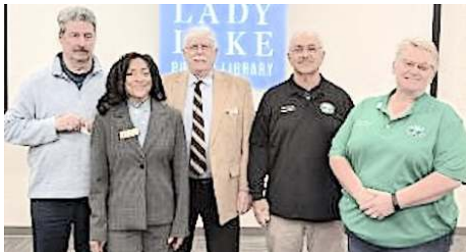
The Lady Lake Library celebrated the grand opening of its expanded Children's Library with an open house, officially welcoming families into a larger, modernized space designed to support learning, creativity, and the town's growing population.