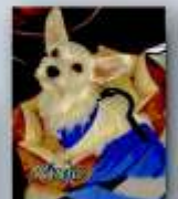
Ninja is paralyzed in his hind legs but enjoys runs with his wheels.

Your donations make it possible to provide medical care, food and shelter to animals in need. On behalf of all the animals, thank you for caring.