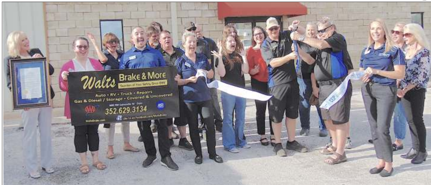
Ribbon cutting by the Ocala Metro CEP Chamber of Commerce was a success.