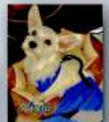
Ninja is paralyzed in his hind legs but enjoys runs with his wheels.

Your donations make it possible to provide medical care, food and shelter to animals in need. On behalf of all the animals, thank you for caring.