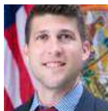
Governor DeSantis sworn in his new Florida Attorney General to take Ashley Moody's place.