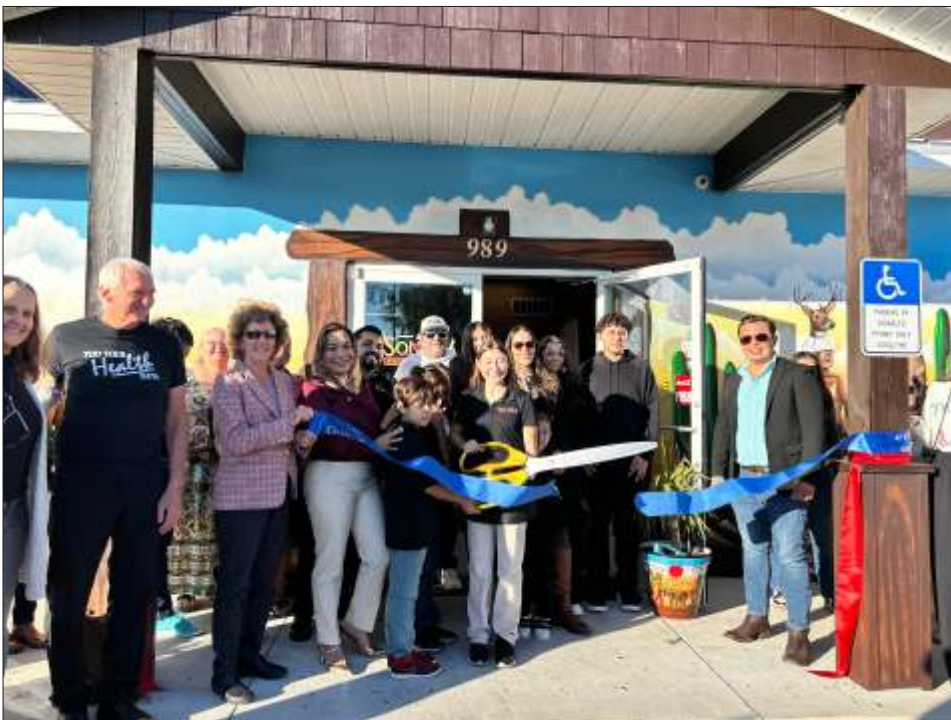
Ay Sonora Mexican Cuisine