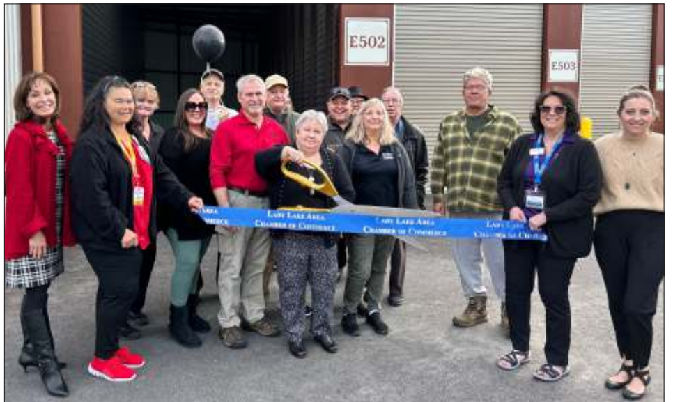
Discount RV-Boat Storage of Lady Lake