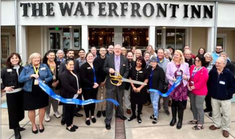
The Waterfront Inn Renovations and Calypso Restaurant