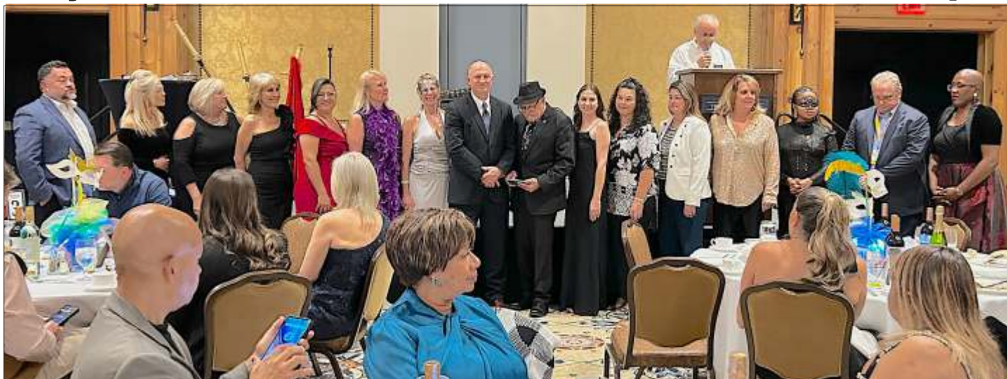
"Leading the Way: The 2025-2026 Board – Stronger Together, Building the Future!"

for the ongoing collaboration between the FBI and local law enforcement.