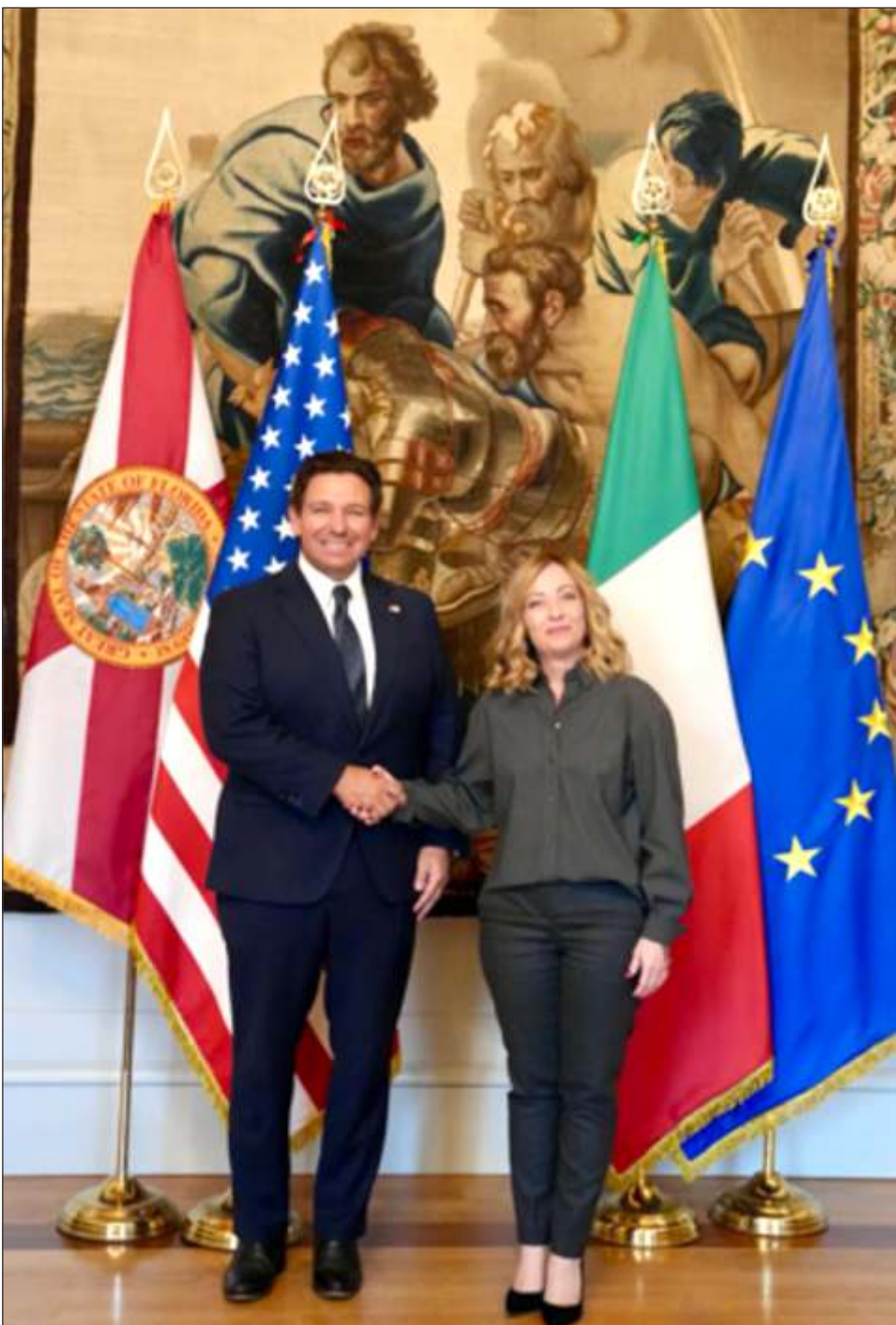
ROME, Italy—Recently, Governor Ron DeSantis met with Italian Prime Minister Giorgia Meloni to grow the relationship between Italy and Florida. Both share common bonds, values, industry, and trade, and many Italian Americans call Florida home. Both are peninsulas with historic significance and uniquely beautiful natural landscapes. Continued page 2

Waste -misuse of funds or resources through excessive or nonessential expenditures. Illegal! (Jail Time!) Waste involves the taxpayers not receiving a reasonable value for money in connection with any government-funded activities due to an inappropriate act. Paying or not paying. Fraud -an attempt to obtain something valuable through intentional