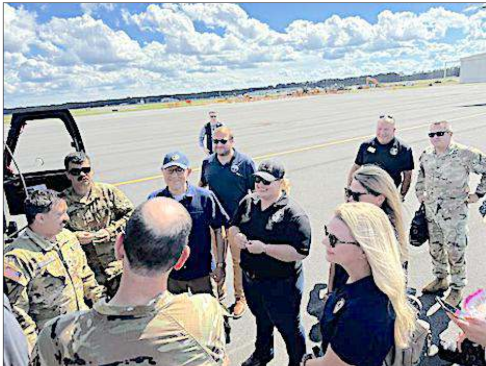
Rep. Cammack and Speaker Johnson talk with members of the Florida National Guard before the helicopter tour of damaged areas.

"I'm grateful to Speaker Johnson for visiting some of Florida's hardest-hit communities today. Seeing the damage and destruction from Hurricane Helene firsthand and hearing directly from the folks who continue to struggle with relief from the federal government was critical,