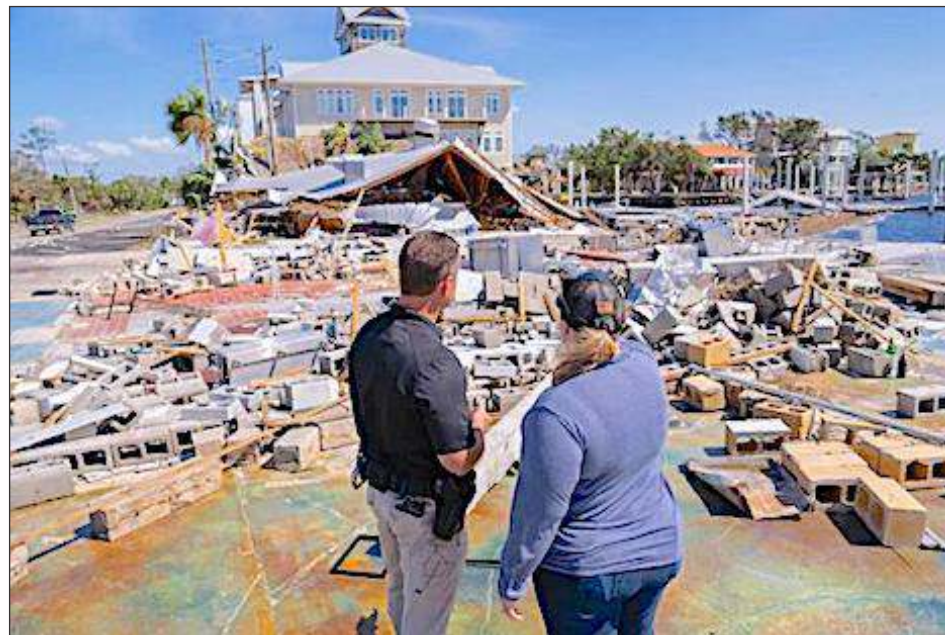
Rep. Cammack tours damage in Florida's Third Congressional District the day after Hurricane Helene made landfall.

especially because these same communities also endured Hurricane Idalia and Debby in the last 13 months. Some of those very same folks have yet to receive the disaster assistance they applied for," said Rep. Cammack. "We're going to continue our efforts to get our region back up and running and I'm grateful for the Speaker's commitment to this work."