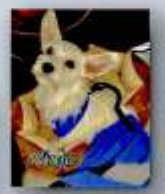
Ninja is paralyzed in his hind legs but enjoys runs with his wheels.

Your donations make it possible to provide medical care, food and shelter to animals in need. On behalf of all the animals, thank you for caring.