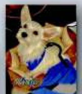
Ninja is paralyzed in his hind legs but enjoys runs with his wheels.

Your donations make it possible to provide medical care, food and shelter to animals in need. On behalf of all the animals, thank you for caring.