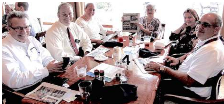
Nothing But Networking was the last networking event of the year. It was well attended and was held at the Waterfront Inn in The Villages. I met some new

their businesses, talking to people, giving free samples. Kitchen Aid had a booth that looked great. A lot of work and detail went