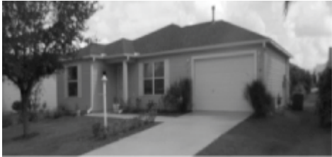
1500 Murrells Inlet Loop

Village of Duval. Furnished 2 bedroom, 2 bath Ranch . Wall to all carpet. Laundry in garage. Central heat/air. 1.5 garage. No smoking.