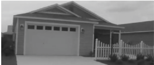
2949 Currie Ct.

NEW VILLA IN FENNEY. Furnished 2 bedroom, 2 bath. Inside laundry, central heat/air. 1.5 garage. No smoking. No pets. $1,350 month.