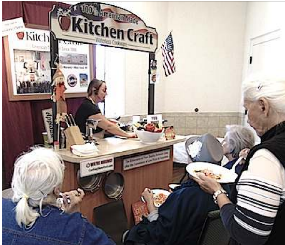
Christmas in the Villages was held at the Wildwood Community center last month. Some 75 vendors attended, showing off

their businesses, talking to people, giving free samples. Kitchen Aid had a booth that looked great. A lot of work and detail went