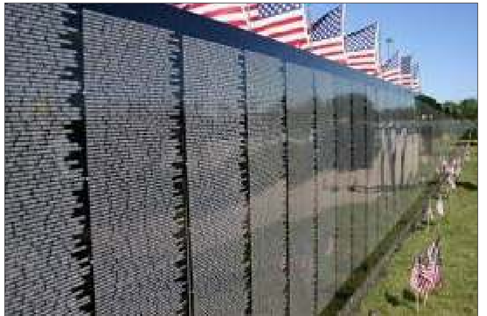
The traveling Wall came to Lady Lake / The Villages. Opened Nov 2 and closed Nov 4th. The Vietnam Traveling Memorial

At the end of the day, my son, his wife and their son came home and there we were the night before Thanksgiving at the Loury Farm and shared memories around the table by having a last minute planned meal for about a dozen family members. That's what I'm thankful for!