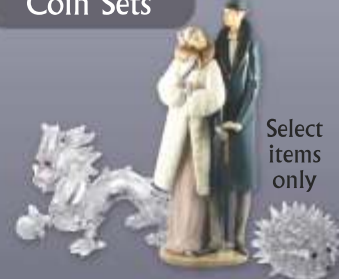
Swarovski & Lladro Figurines