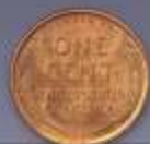
Wheat Cents 1.2¢ & Up*