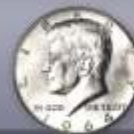
Pre-'65 Halves $4.50 & Up*