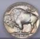
Buffalo Nickels 20¢ & Up*