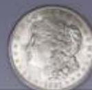
Morgan Dollars $10 & Up*