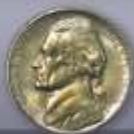
Silver War Nickels 20¢ & Up*