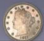
'V' Nickels 20¢ & Up*