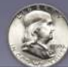
Franklin Half Dollars $4.50 & Up*