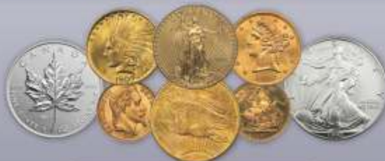
U.S. & Foreign Bullion Gold & Silver, & Platinum