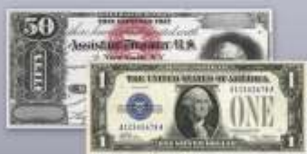
U.S. & Foreign Paper Money