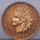
Indian Cents 20¢ & Up*