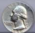
Pre-'65 Quarters $2.25 & Up*