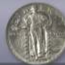
Standing Quarters $2.25 & Up*