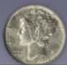
Mercury Dimes $0.90 & Up*