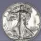
Walking Liberty Halves $4.50 & Up*