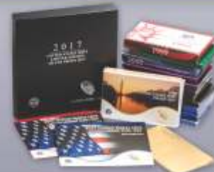
Proof & Mint Coin Sets