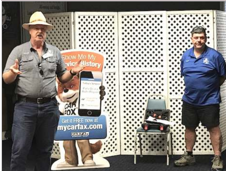
Pal's Automotive Repair shop, shown here, is informing their audience about the importance of good tires.