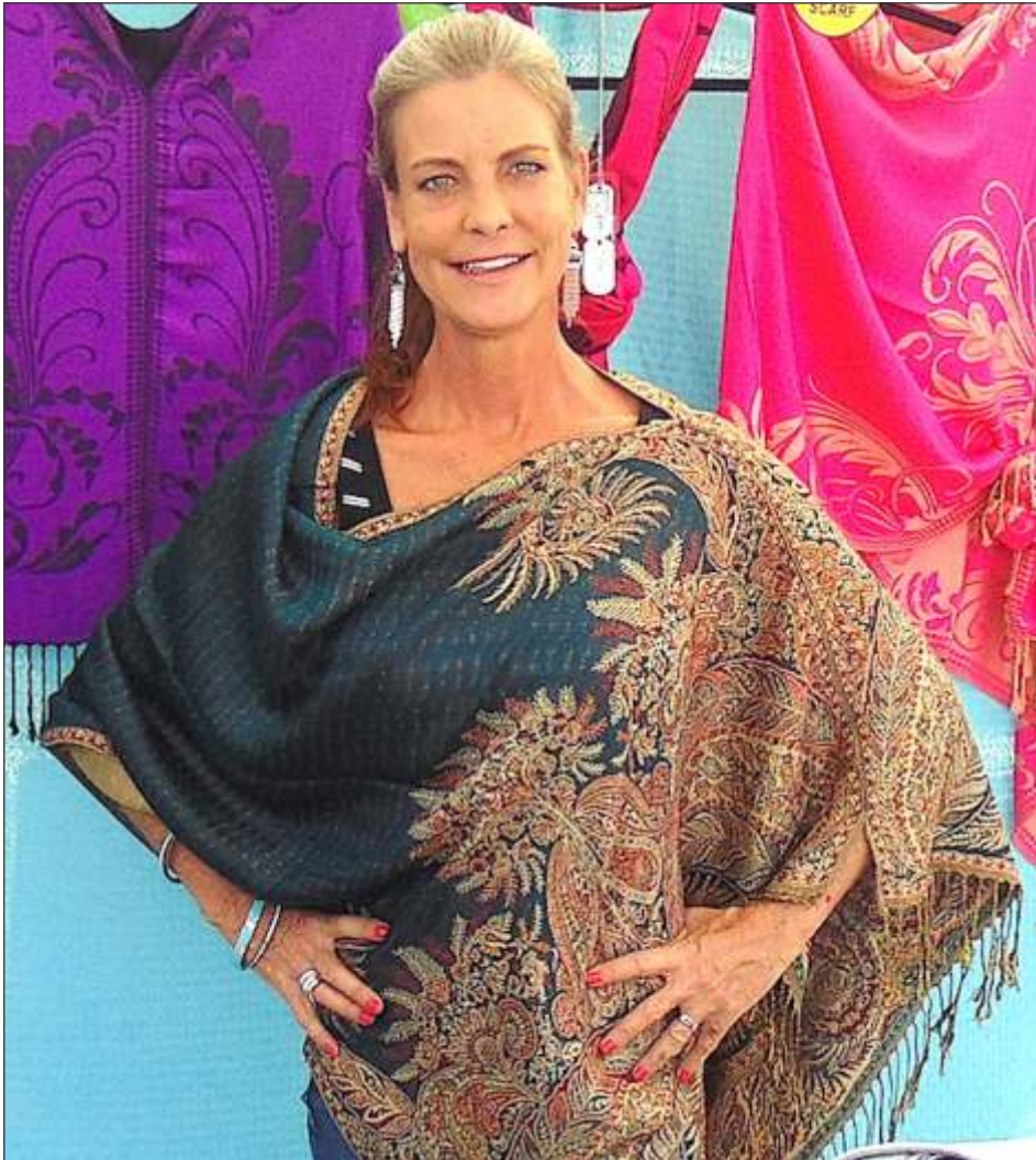
Pictured at the "Shop Lady Lake Expo & Crafts Show" The vendor modeling her Urban Poncho from Urban Poncho. The expo was well attended with visitors coming and going all day, a steady flow.