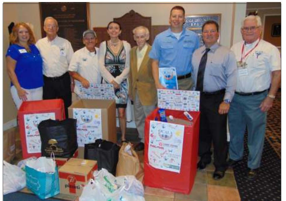
The first Ocala Business Leaders Charity Drive for Feed the Need Donations! Some 8 to 10 Ocala Business Leaders place boxes in their place of business to raise funds for the needy. Some businesses contributed cash. Thanks OBL for your fund raising.

God Bless our Troops Support Our Veterans We Endorse The Constitution