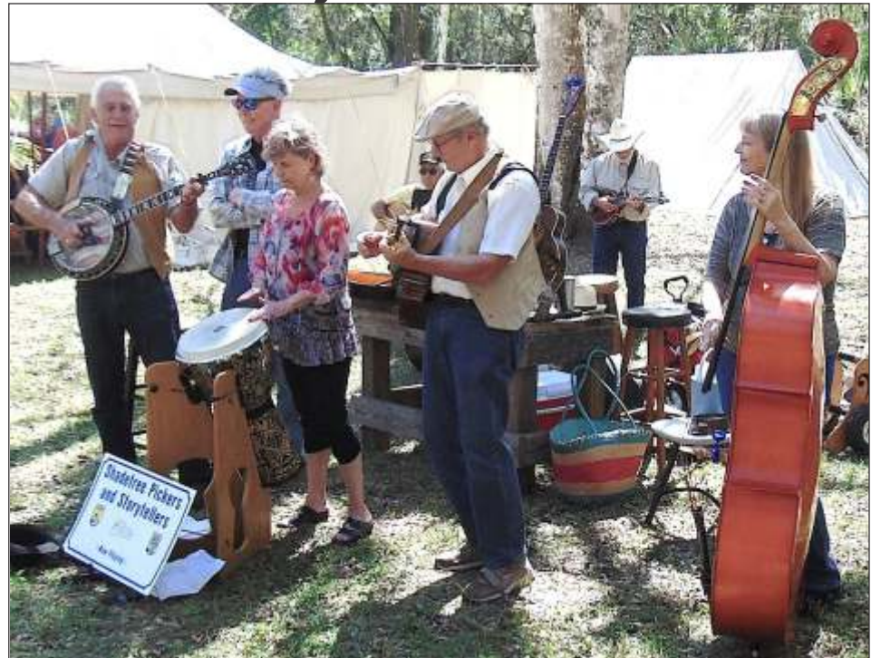
Cracker Days is an event held every year by Rainbow Springs State Park because the park and this area is rich with history. During the event pioneers are cracking the whip, making soap, making cheese, playing music, showing animal hides, snake skins and just showing tools used in the old days. Don't miss next year. See more on page 6.