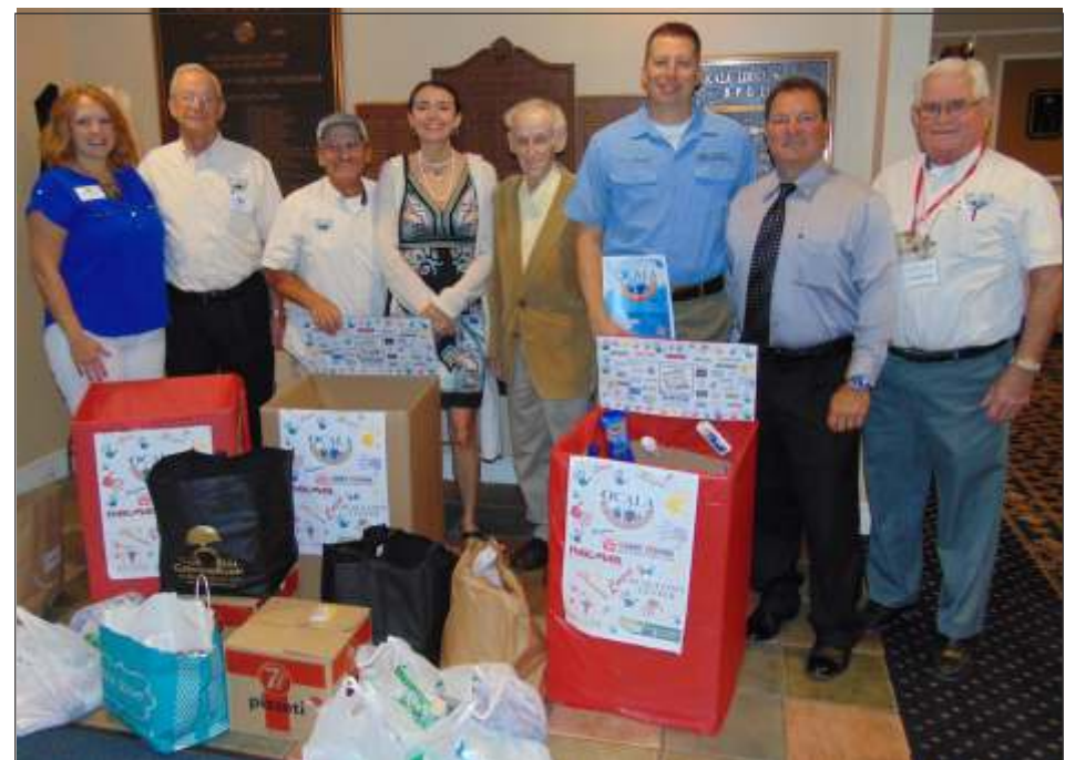
The first Ocala Business Leaders Charity Drive for Feed the Need Donations! Some 8 to 10 Ocala Business Leaders place boxes in their place of business to raise funds for the needy. Some businesses contributed cash. Thanks OBL for your fund raising.

PRSR STD ECRWSS U.S. POSTAGE PAID OCALA, FL PERMIT NO. 168 *****ECRWSSEDDM**** Postal Customer Ocala, FL