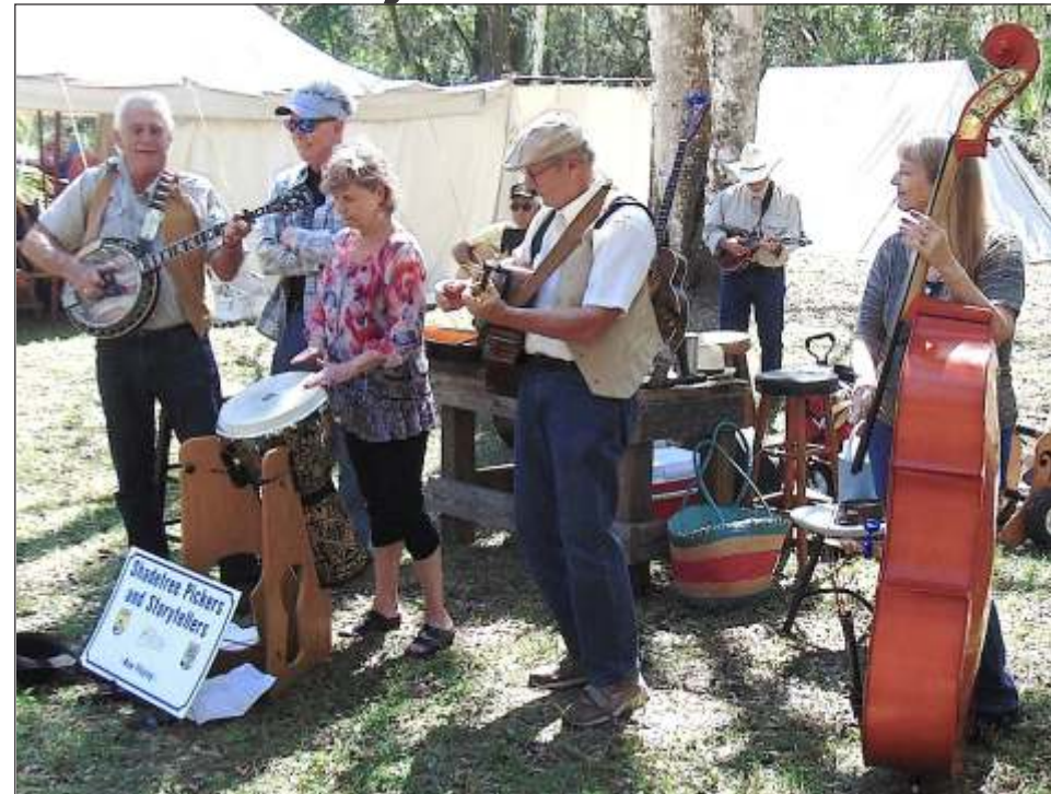
Cracker Days is an event held every year by Rainbow Springs State Park because the park and this area is rich with history. During the event pioneers are cracking the whip, making soap, making cheese, playing music, showing animal hides, snake skins and just showing tools used in the old days. Don't miss next year. See more on page 6.