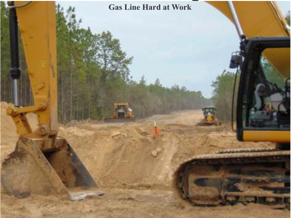
Gas Line Hard at Work

The Sabal Trail Gas pipeline is rolling through Marion County. Two years ago the gas pipeline authorities held meetings about