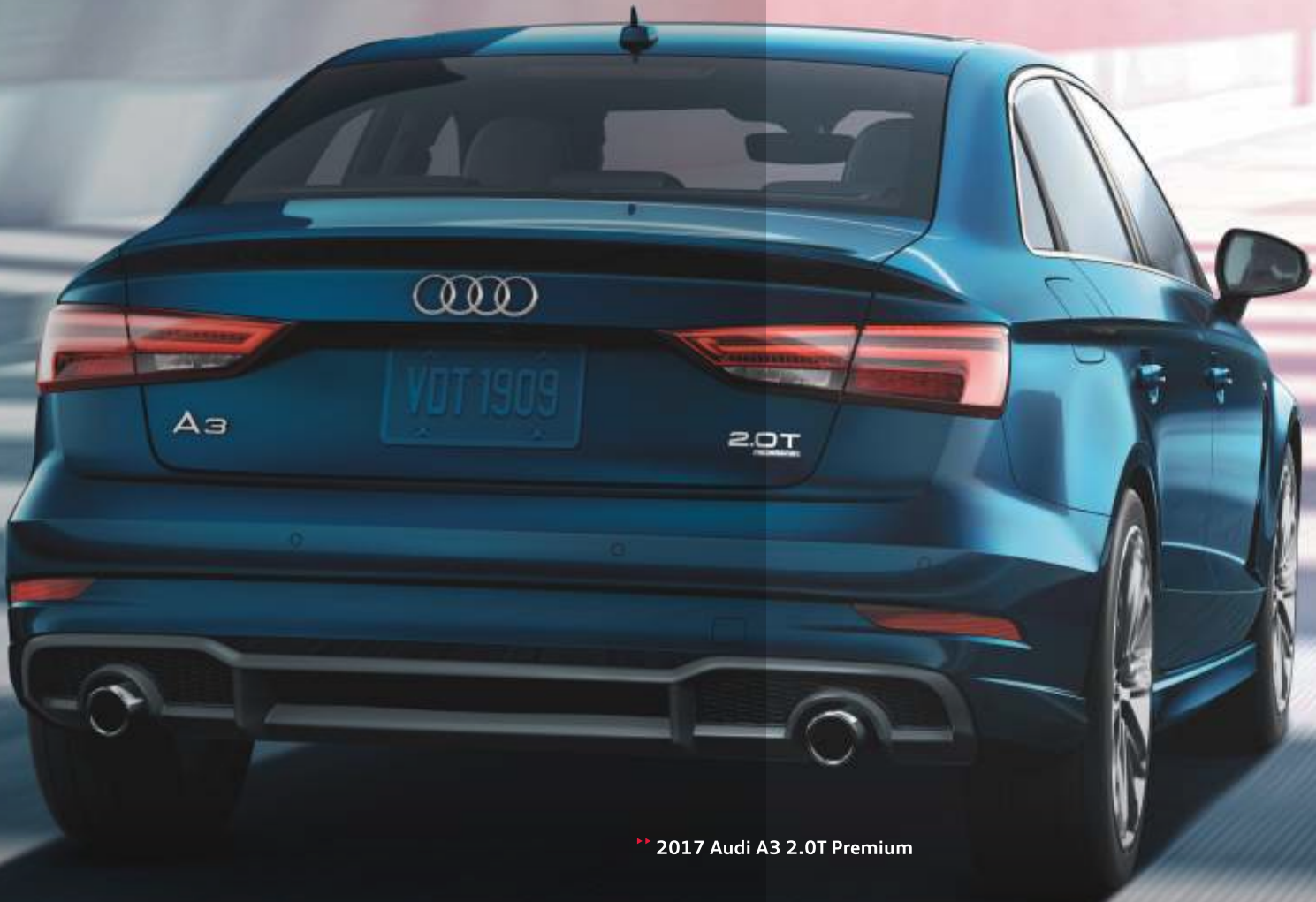
►► 2017 Audi A3 2.0T Premium

At Audi Gainesville, we pride ourselves on being straightforward and transparent for our customers. The price you see is the price you get, no hidden fees, no surprises. We aim to earn your trust by treating you right.