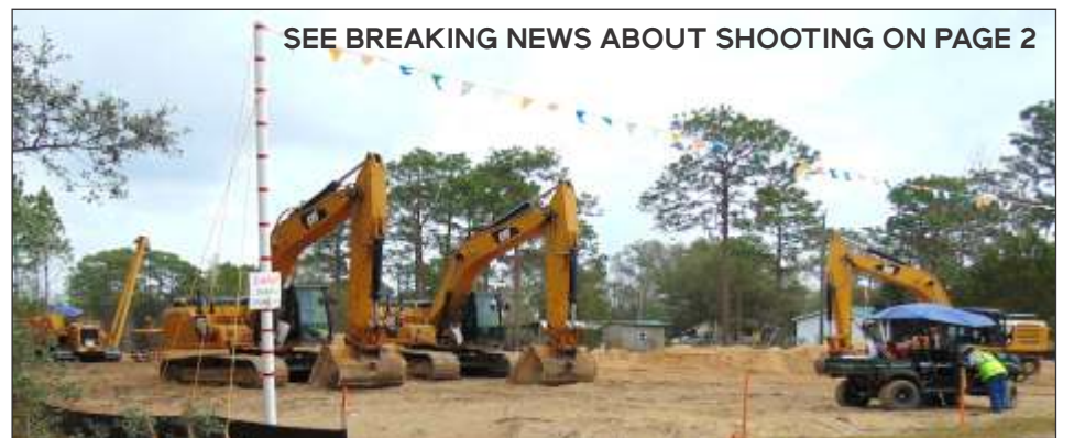
SEE BREAKING NEWS ABOUT SHOOTING ON PAGE 2

The Sabal Trail Gas Line is rolling through Marion County. Two years ago the Gas Line authorities held meetings about informing the public of their intentions, then last year they held town hall meetings in all then small communities and things were about to calm down, when they started digging and people realized oh this gas line is here now. They started protesting, but by