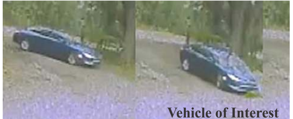
Vehicle of Interest