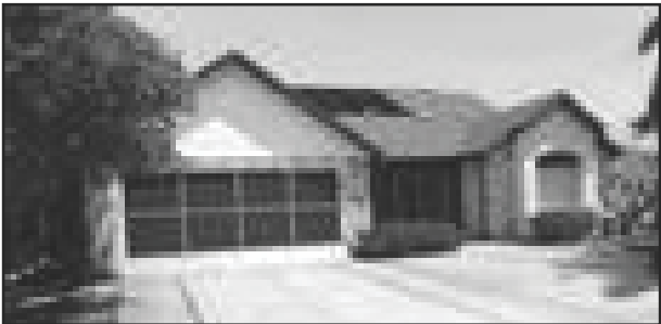
1015 DELMAR DR The Villages

6.4 Acres fronting CR 25/Teague Trail, across from Post Office. Zoned CP 'Planned Commercial' which provides for any commercial land use subject to Town Approval. Town water and sewer available. $900,000