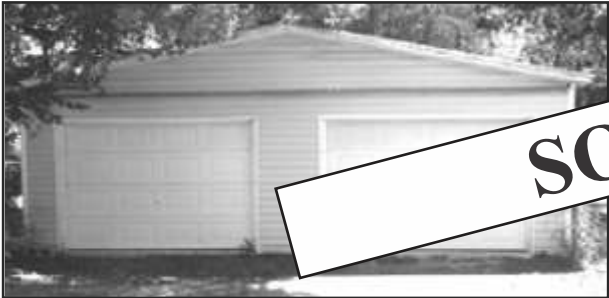
103 FOURTH ST Lady Lake

Two bedroom singlewide mobile home. Storage shed. Partially fenced 50' x 125' lot. Low Price ~ $23,000