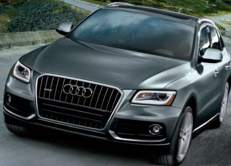
2017 Audi Q5

Free? Check. Easy? Check. Pickup & Checkup.