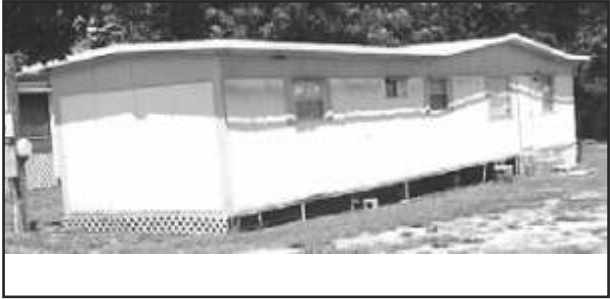
10385 SE 149th LN Summerfield

NO BOND: Located in Village of Mira Mesa. Roomy, split plan 3 bedroom, 2 bath. Solar tubes for extra light. Pull-out shelves, extra cabinets in kitchen. Swim/spa on screened Lanai. Roll-down storm shutters. $199,900