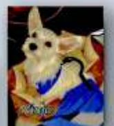
Ninja is paralyzed in his hind legs but enjoys runs with his wheels.

Your donations make it possible to provide medical care, food and shelter to animals in need. On behalf of all the animals, thank you for caring.