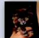
Fuchsa is a 15 week old paralyzed kitten full of love.

Bilbie is a 14 weeks old male brought to the HSMC with her brother Wombat! We believe they could be Xolaitzcuinli, or Xolo, which is Mexican hairless dog breed.