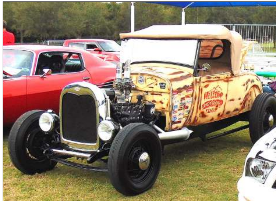
Picture of street Rod built from 30's model Ford with a flathead Ford motor