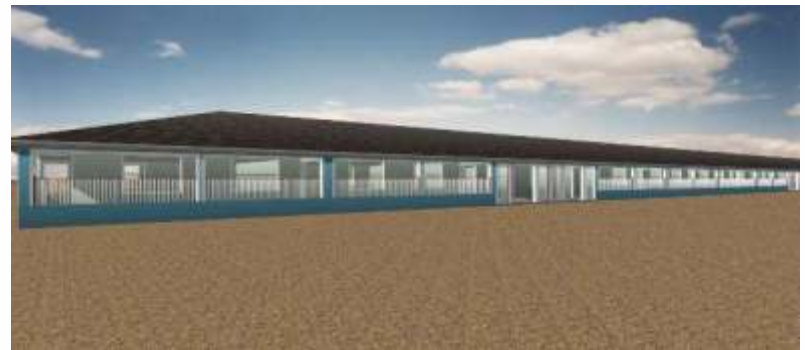
TNU Proposed 8 Classroom Building

Completion of Phase II of Classroom building $14,500.00