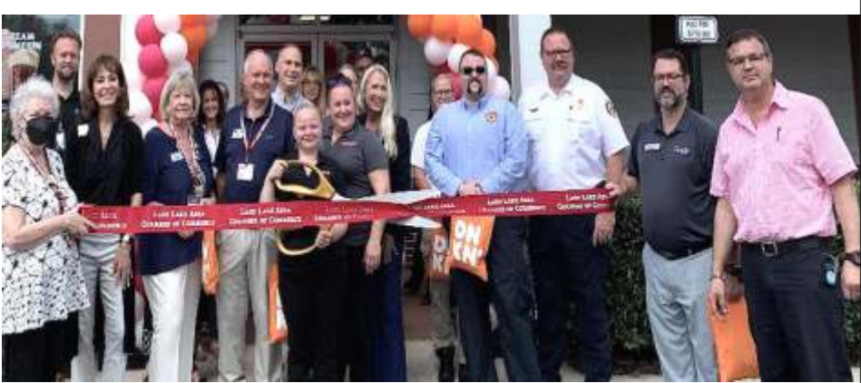
Dunkin Grand Re-Opening and Ribbon Cutting Aug 26th 3460 Wedgewood Lane, The Villages