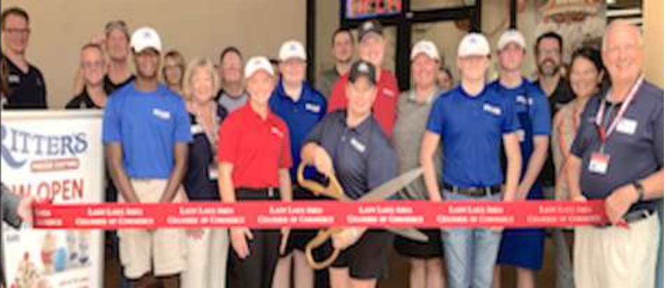
Ritters Frozen Custard & Burgers Grand Opening 1572 Bella Cruz Dr, The Villages