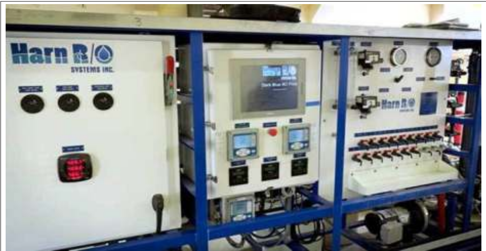
District Helps Plant City Celebrate Opening of Demonstration Facility

Plant City recently celebrated the opening of its One Water Demonstration Facility. The site will test water purification technology for a potential full-scale project to create a drinking water supply. District leaders were on hand to applaud Plant City's innovative step in exploring the opportunities recycled water could provide in ensuring the area's future drinking water supply. See www.swfwmd.state.fl.us for more.