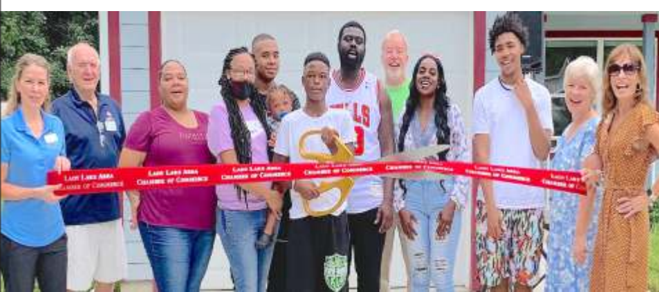
Habitat for Humanity Harper Family Dedication