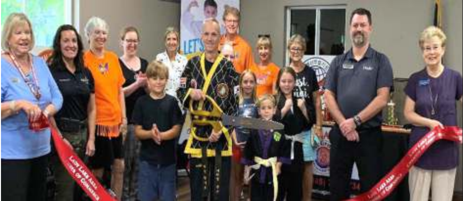
Iron Dragon Grand Opening and Ribbon Cutting Sept 2nd at the Lady Lake Community Building, 237 W Guava St., Lady Lake.