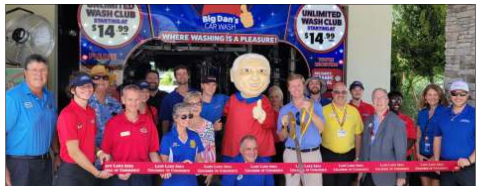
Here is a recent Ribbon cutting for Big Dan's Car Wash . The ribbon cutting was put on by the Lady Lake Chamber of

Villages® Hospital. Patients can now easily access their orthopedic specialist by golf cart.