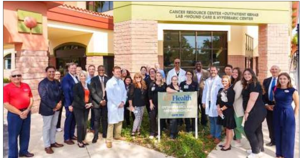
UF Health Orthopedics and Sports Medicine - Spanish Springs officially cut the ribbon for its new office located across the highway from UF Health The

The representative of the Governor said I want to assure you that Kat Cammack is being endorsed by Governor DeSantis. I said endorsing her means having her name on