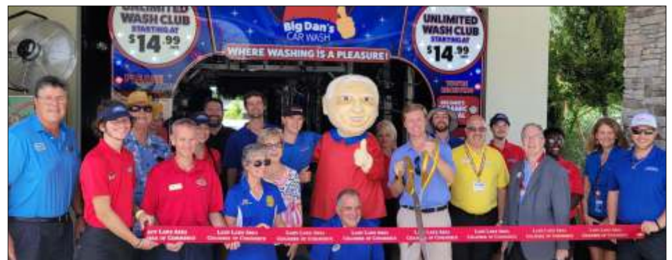
Here is a recent Ribbon cutting for Big Dan's Car Wash . The ribbon cutting was put on by the Lady Lake Chamber of

Villages® Hospital. Patients can now easily access their orthopedic specialist by golf cart.