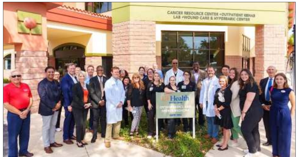
UF Health Orthopedics and Sports Medicine - Spanish Springs officially cut the ribbon for its new office located across the highway from UF Health The

The representative of the Governor said I want to assure you that Kat Cammack is being endorsed by Governor DeSantis. I said endorsing her means having her name on