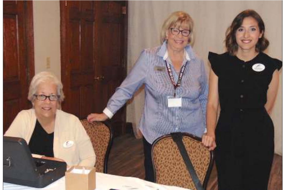
This months Lady Lake Chamber Networking Luncheon at Harbor Hills was a great success. Food was good, met new

people, met some business people I have not seen in a while, It was a good day!