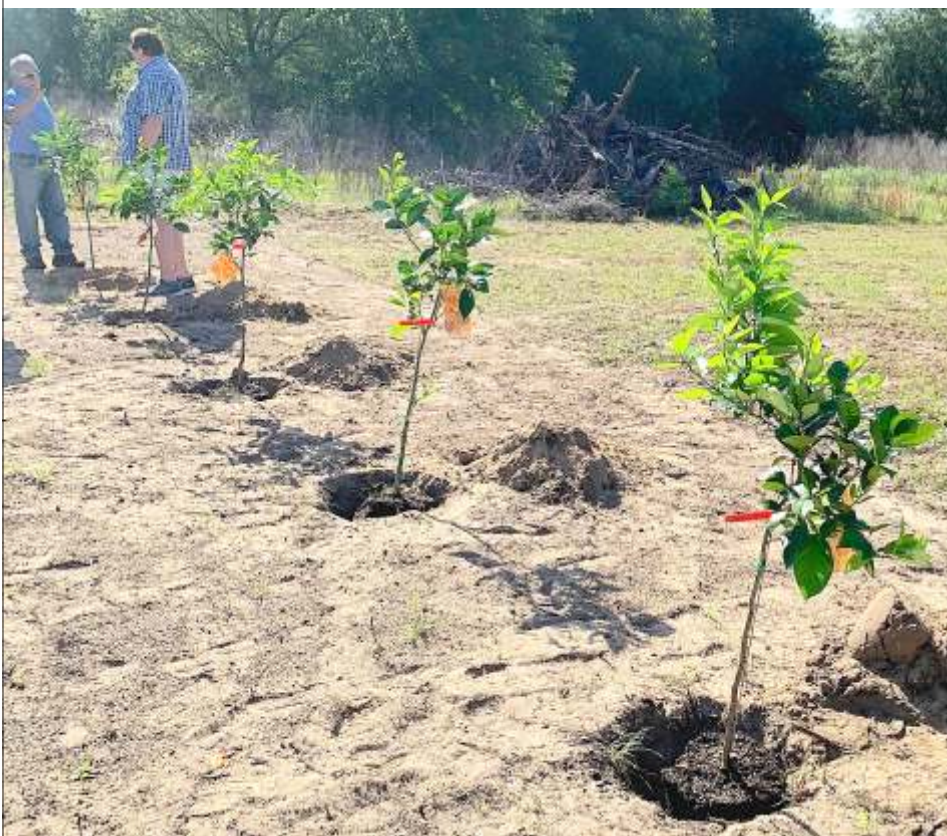
The Town of Lady Lake celebrated Church of Lady Lake. Miss Leesburg and Arbor Day with the Lady Lake Garden Teen Miss Leesburg joined in on the fun! Club planting 8 trees at the First Baptist