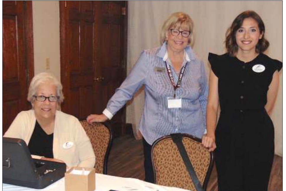
This months Lady Lake Chamber Networking Luncheon at Harbor Hills was a great success. Food was good, met new people, met some business people I have not seen in a while, It was a good day!