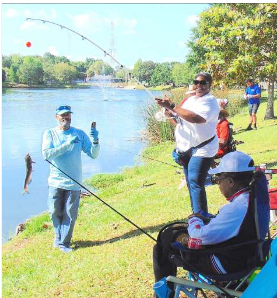
The 19th annual Senior Fishing Derby was a great success. Over a 125 registered to spend the morning at the Park. A lot of