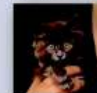
Fuchsia is a 15 week old paralyzed kitten full of love.

Bilbie is a 14 weeks old male brought to the HSMC with her brother Wombat! We believe they could be Xoloitzcuintli, or Xolo, which is Mexican hairless dog breed.