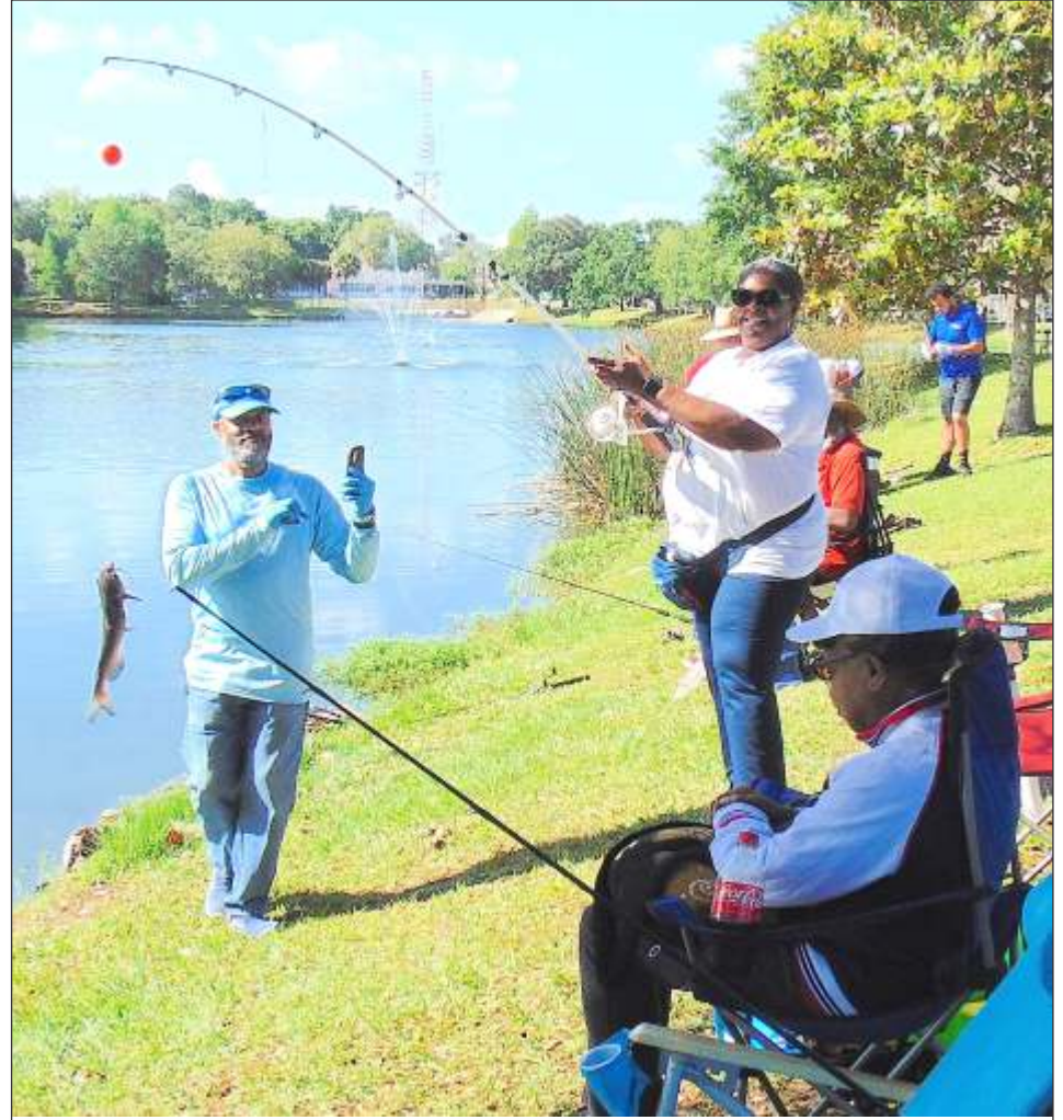
The 19th annual Senior Fishing Derby was a great success. Over a 125 registered to spend the morning at the Park. A lot of