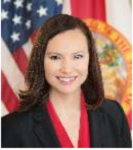
Attorney General Moody and Congressman Posey Announce Legislation to Give States the Ability to Enforce Immigration