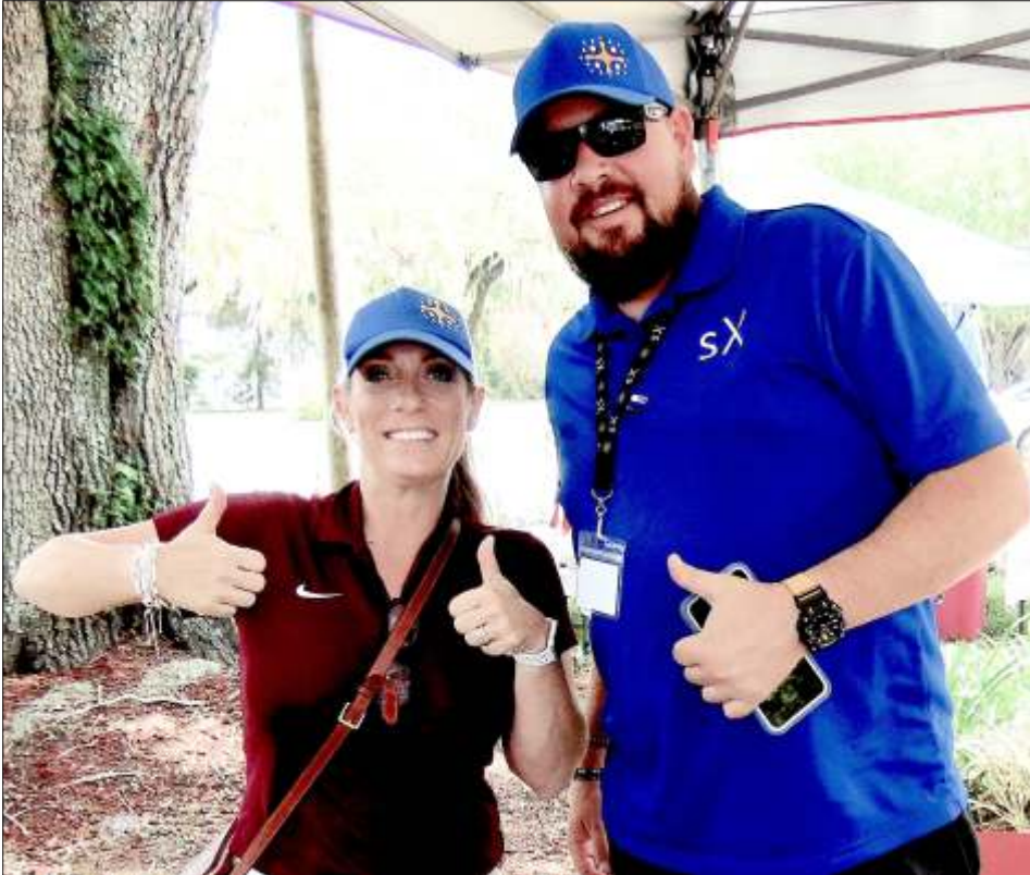
Pictured is a couple of vendors giving me a thumbs up they were selling American made Xpert Solar systems.