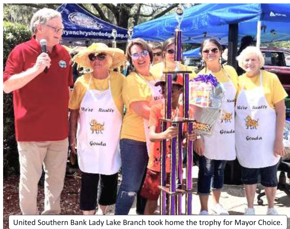
United Southern Bank Lady Lake Branch took home the trophy for Mayor Choice.