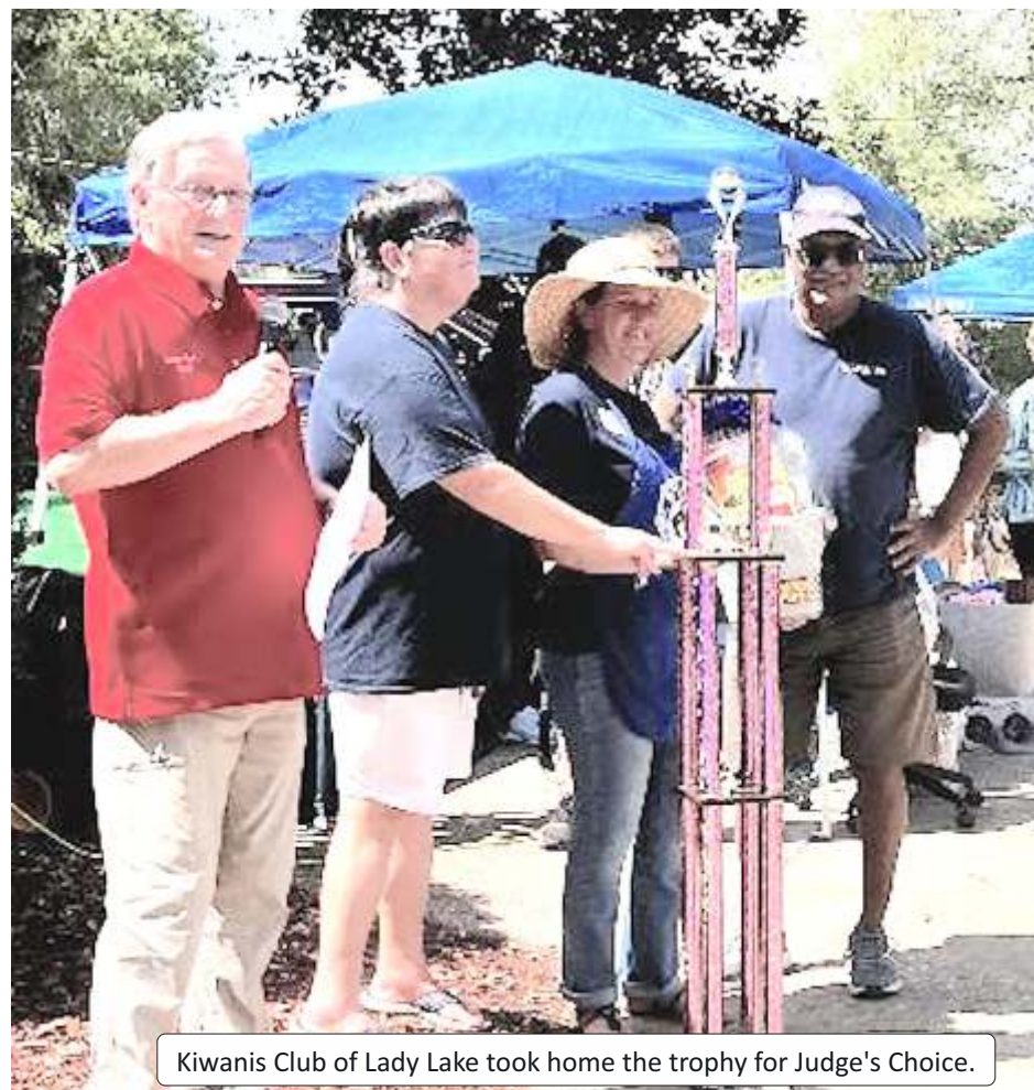
Kiwanis Club of Lady Lake took home the trophy for Judge's Choice.