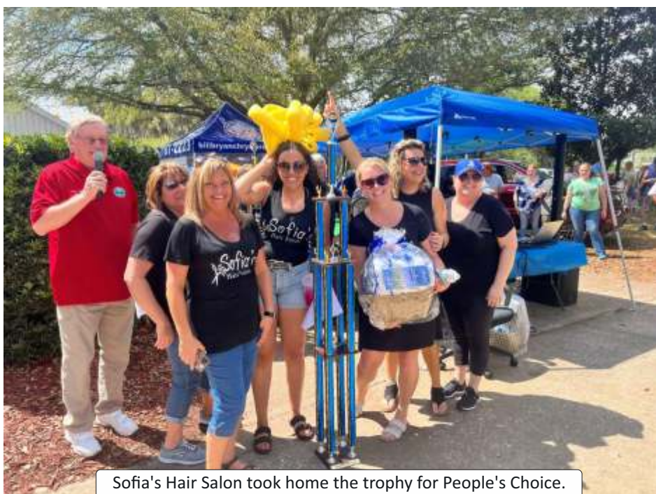
Sofia's Hair Salon took home the trophy for People's Choice.