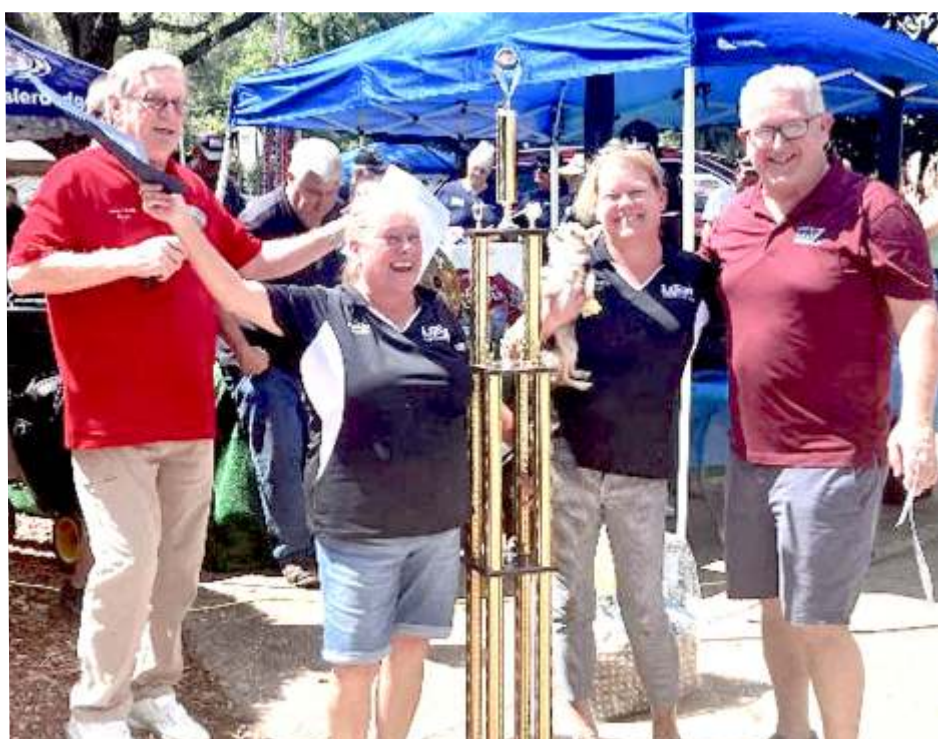
Lake Glass & Mirror took home the Big Cheese Trophy for best decorated booth.