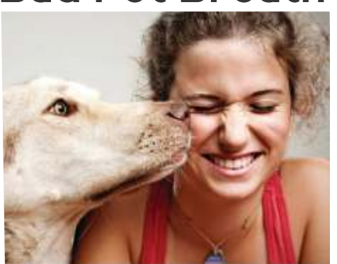
Bad Pet Breath Can Mean Health Issues