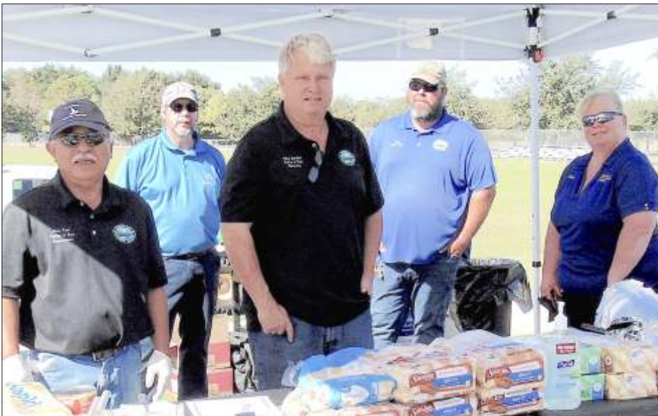
Pictured is the Lady Lake Parks Department. At this event they are fundraising for money to have fireworks. A great bunch of people. They were giving out information about the Christmas Parade.