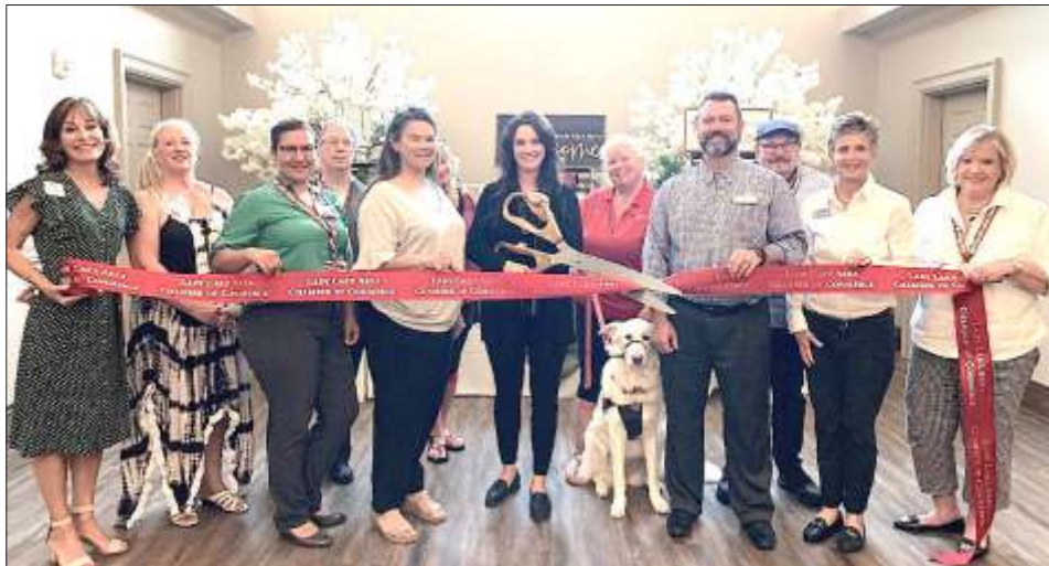
Dignity Memorial Ribbon Cutting and Open House with Lady Lake Area Chamber, October 11, 2021, 7134 Powell Rd Wildwood, FL 34785