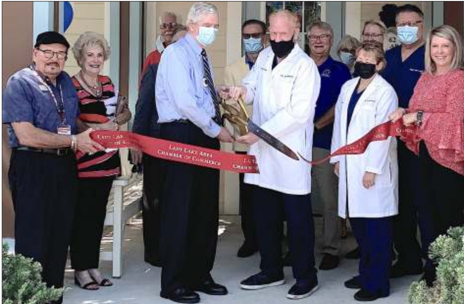
Ribbon Cutting and Grand Re-Opening September 8th Congressman Daniel Webster Cutting the Ribbon. at Vascular Vein Centers. Wednesday,