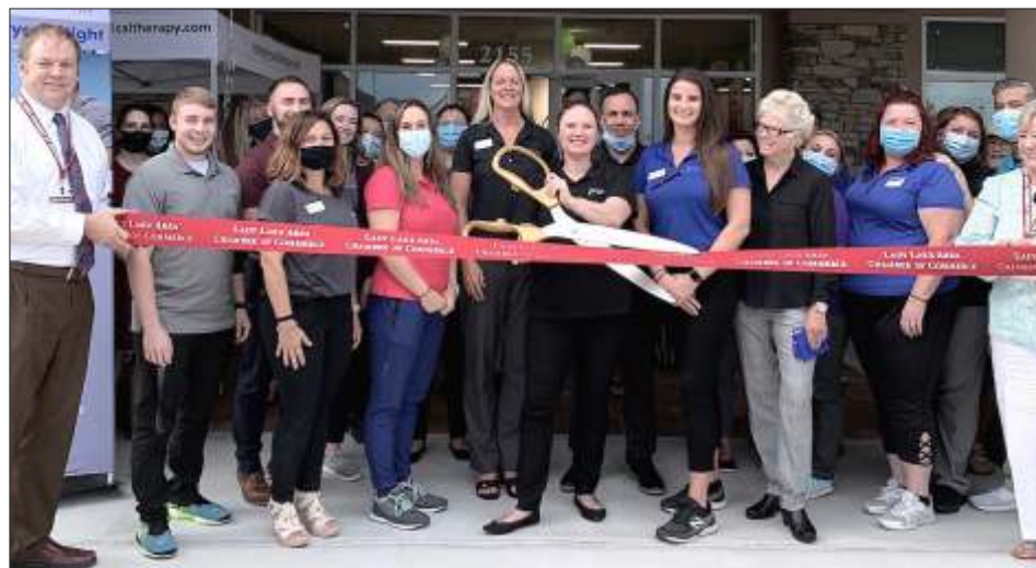
Ribbon Cutting at CORA Physical Therapy, Thursday Aug 26, 2021 2155 Everglades Lane, The Villages in Magnolia Plaza.

For example, the Social Security Trust Fund has run a surplus since 1987