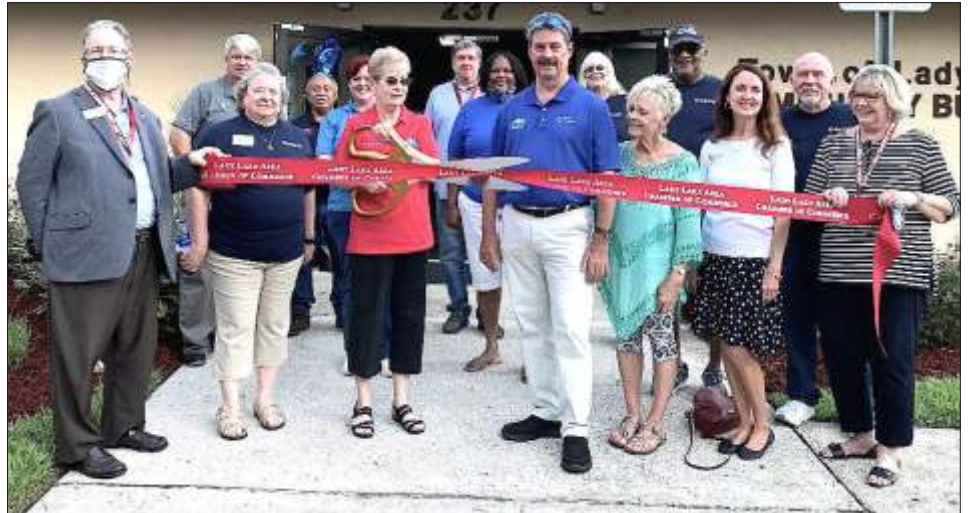
Ribbon Cutting at Lady Lake Community Building with Mayor Ruth Kussard cutting the ribbon on Saturday Sept 18, 2021.