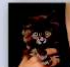
Fuchsla is a 15 week old paralyzed kitten full of love.