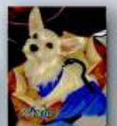
Ninja is paralyzed in his hind legs but enjoys runs with his wheels.

Your donations make it possible to provide medical care, food and shelter to animals in need. On behalf of all the animals, thank you for caring.