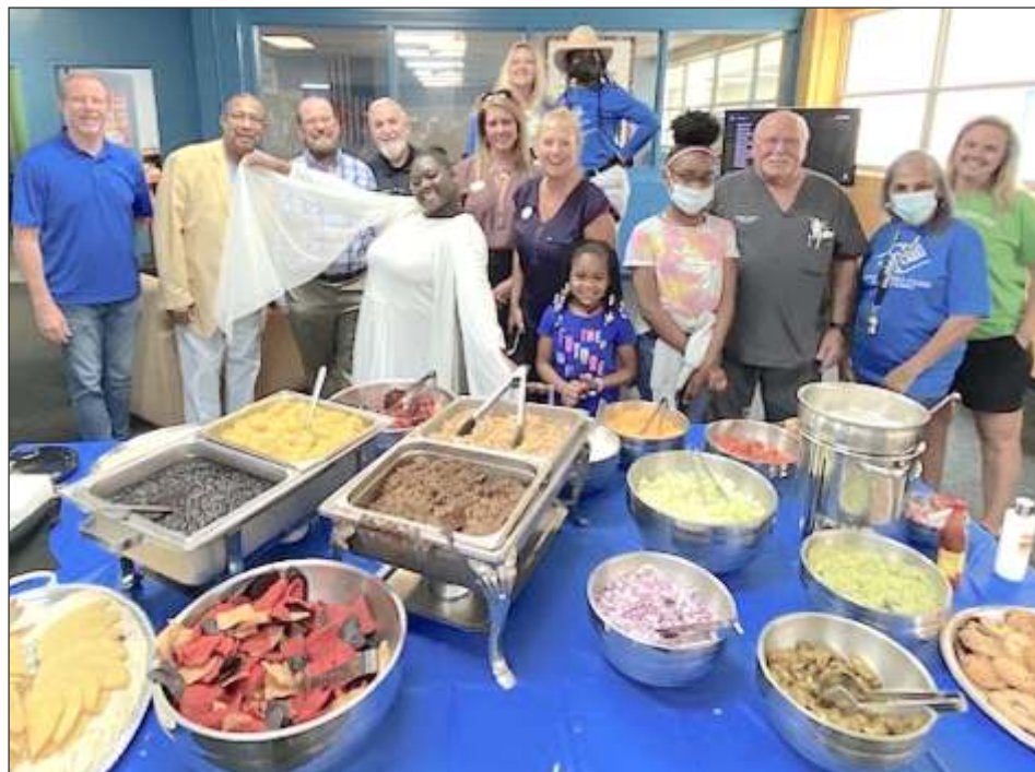
Pictured are Boys and Girls club and visitors at an open house hosted by Boys and Girls club / attended OBL club. Great spread of food and happy people. You can

High Springs, Florida 32643 Hours: Mon - Fri, 9:00 a.m. - 5:00 p.m.