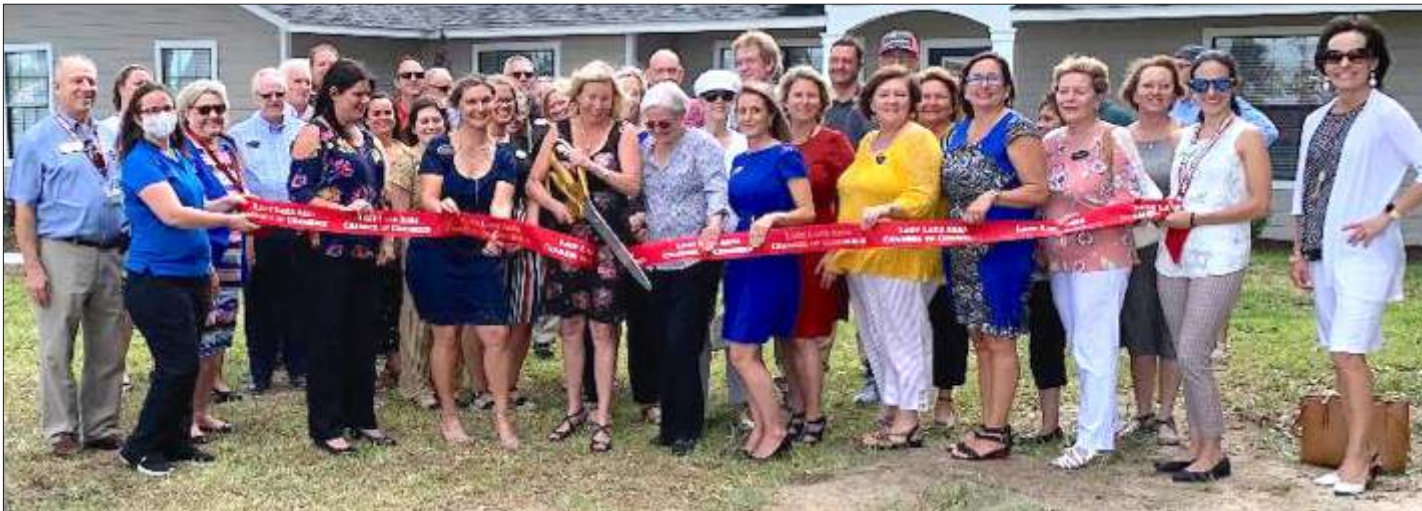
May 20th Ribbon Cutting and Grand Opening at Affiliated Title, 5805 E CR 462 Wildwood, FL 34785.