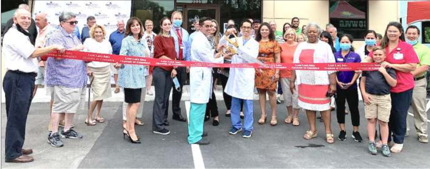
Grand Opening and Ribbon Cutting for Optimotion Orthopedics 5555 E SR 44 Wildwood, FL 34785