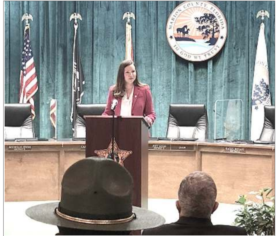
Attorney General Moody speaking at Officer Memorial in Ocala Florida. the Marion County Sheriff's Office Fallen