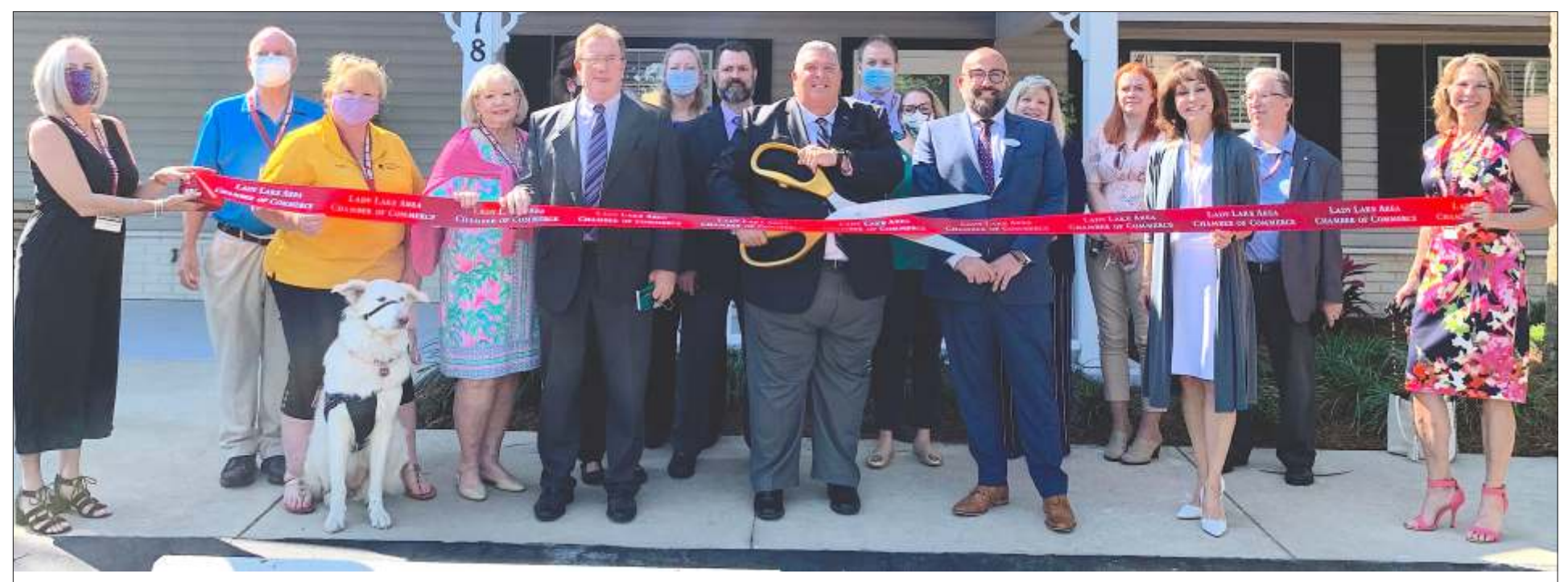
Lady Lake Chamber held a ribbon cutting for Hiers Funeral home. As you can see it was well attended.