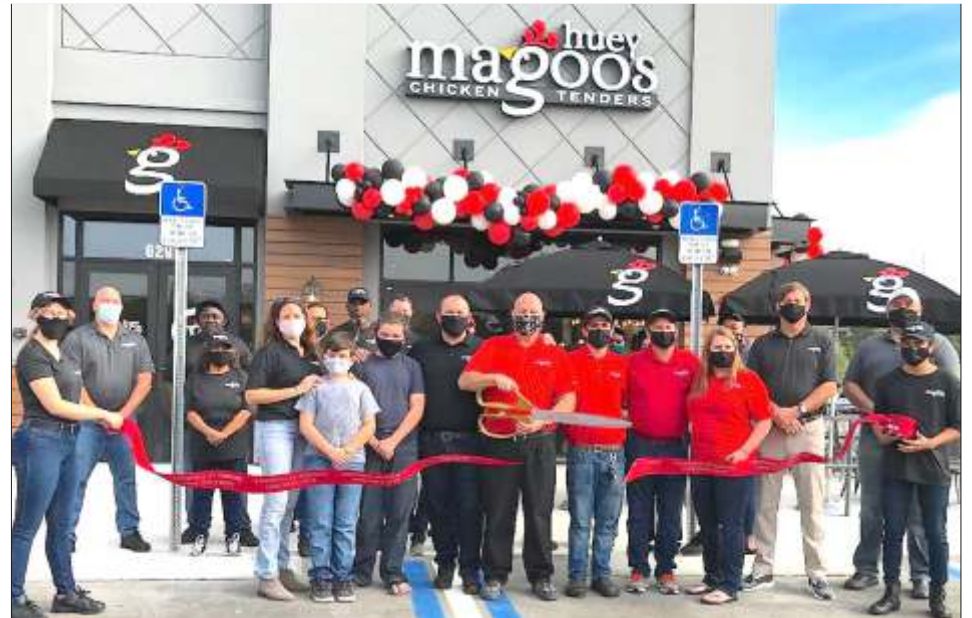
Huey Magoos Celebrated their Grand Opening and Ribbon Cutting on Friday, November 20, 2020, located at 629 N Hwy 27/441, Lady Lake, FL 32159.