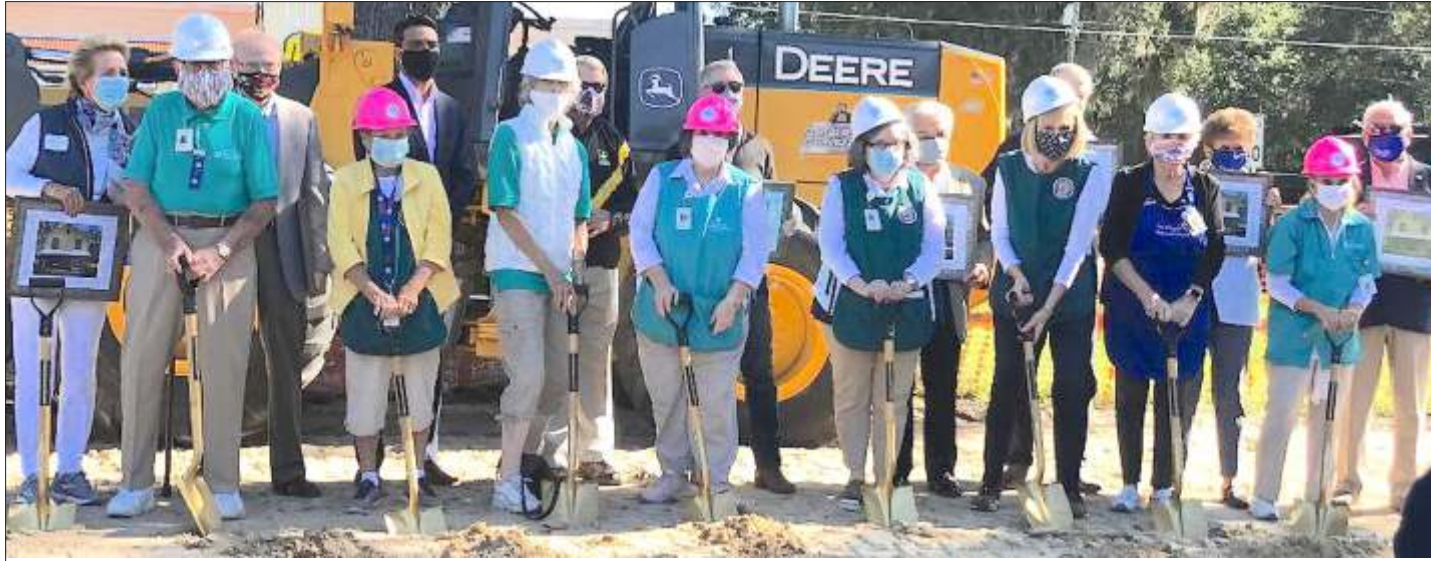
Ground Breaking for Ye Ole Thrift Shoppe, located next to the Log Cabin, Lady Lake. We are looking forward to the new addition.