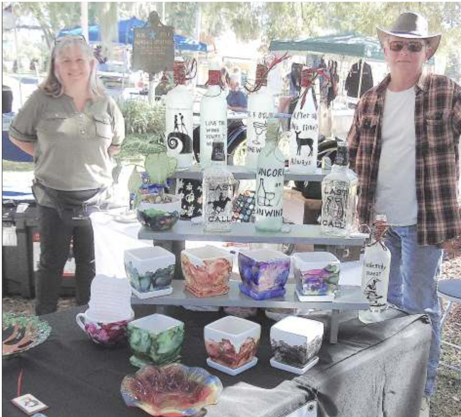
Lady Lake Chamber Market Place every Tuesday morning at the Log Cabin Lady Lake Chamber Headquarters. Look at all the possible Christmas Gifts you purchaser there. Next Tuesday morning. See you there!