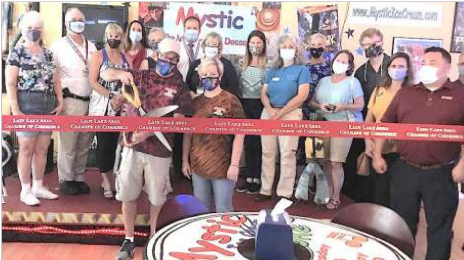
Mystic Ice Cream, New Owners, great Ice Cream, Music and Fun located at 1217 Miller Blvd, Fruitland Park.