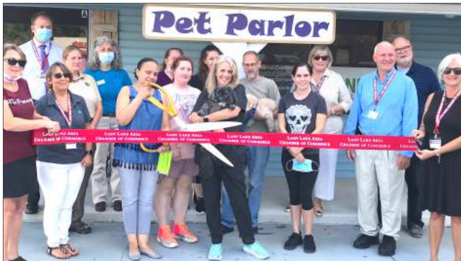
Just Dandy Pet Pet Parlor has moved to a New Location 201 W Miller ST, Fruitland Park.