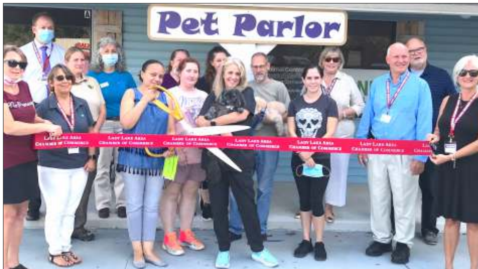
Just Dandy Pet Pet Parlor has moved to a New Location 201 W Miller ST, Fruitland Park.