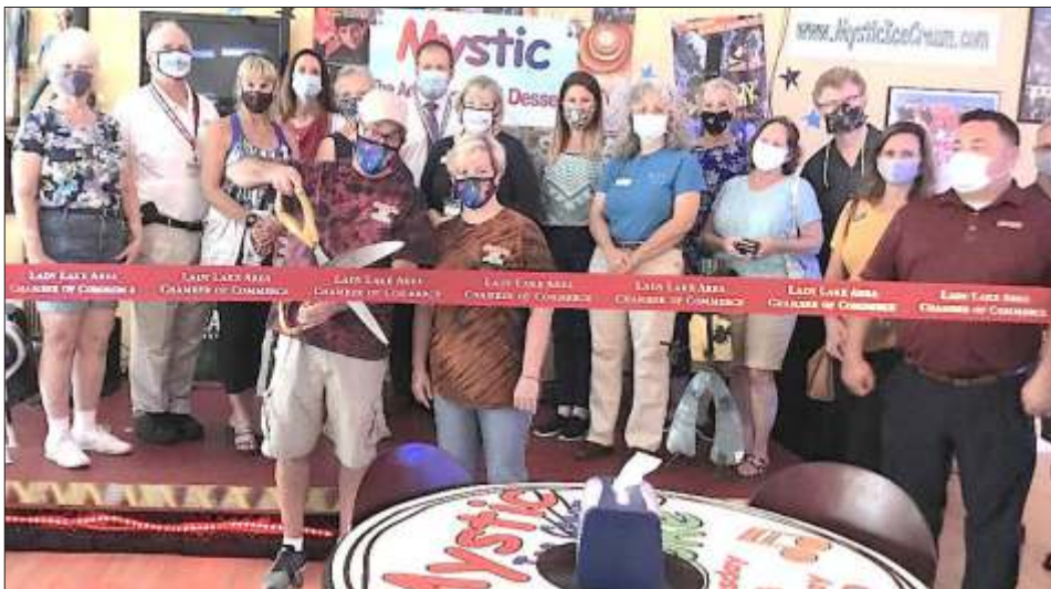
Mystic Ice Cream, New Owners, great Ice Cream, Music and Fun located at 1217 Miller Blvd, Fruitland Park.