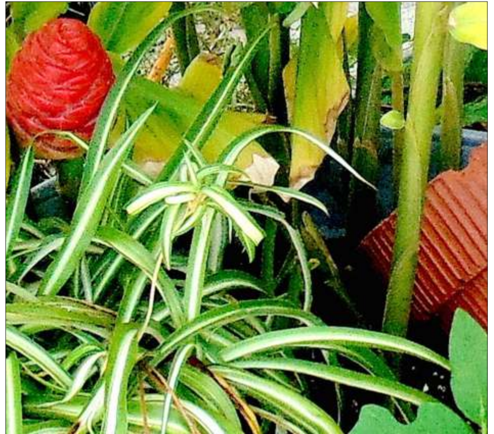
Ginger Plant