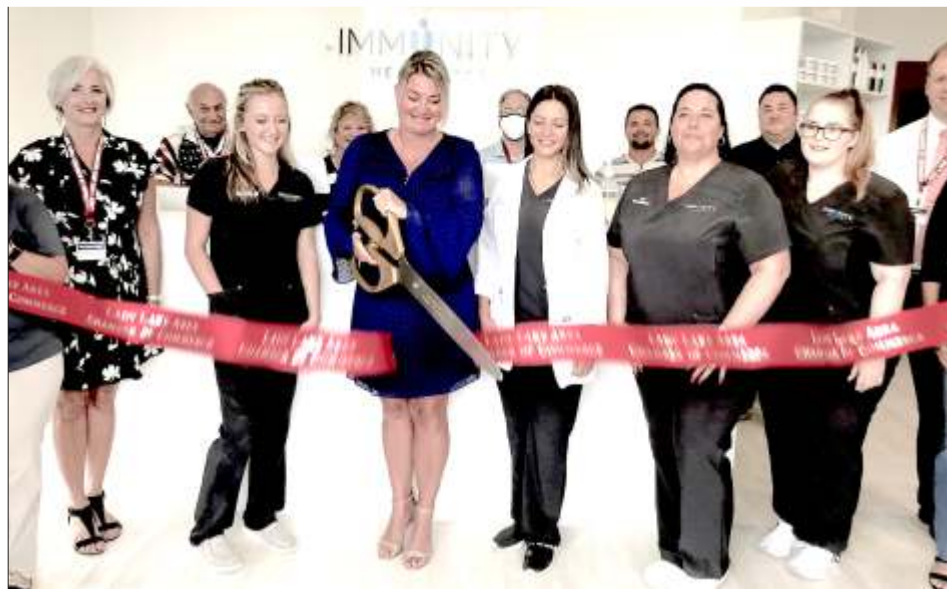
The Lady Lake Chamber of Commerce welcomes the Immunity Health Spa to the area. They held a Grand Opening and