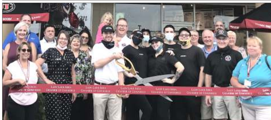
Lady Lake Chamber of Commerce held a Ribbon cutting for Jimmy John's. They claim they have Freeky Fast and Freeky