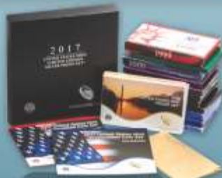
Proof & Mint Coin Sets