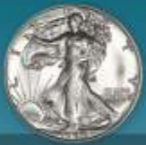
Walking Liberty Halves $4.50* up to $12,000