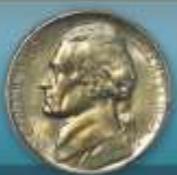
Silver War Nickels 20¢* up to $2,700