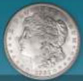
Morgan Dollars $10* up to $55,000