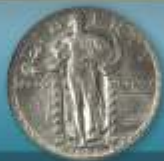
Standing Quarters $2.25* up to $2,800