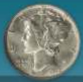
Mercury Dimes $0.95* up to $5,800