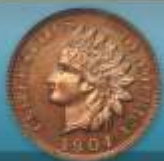
Indian Cents 20¢* up to $5,000