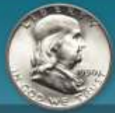
Franklin Half Dollars $4.50* up to $36