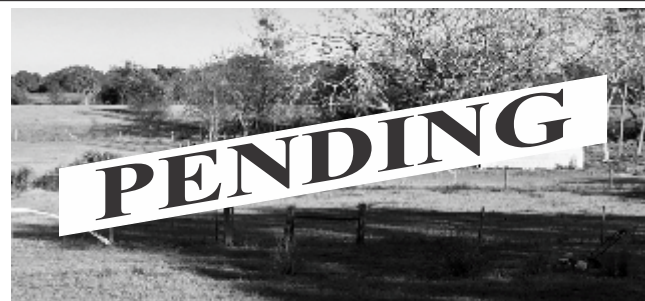
4821 SUNNYSIDE DR FRUITLAND PARK

Block 3 bedroom, 2 bath home on tree shaded lot. Central heat/air, inside laundry, storage/workshop, screened back porch. New paint throughout. Fenced back yard, paved driveway, fronting paved road. Close to City Hall, new Library, park and pool. Reduced - $117,500