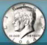
Pre-'65 Halves $4.50* up to $8