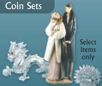
Swarovski & Lladro Figurines