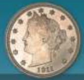
'V' Nickels 20¢* up to $1,300