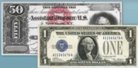
U.S. & Foreign Paper Money