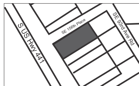
15600 HWY 441 SUMMERFIELD

Ideal starter or winter home. 2 bedroom, 1 bath plus bonus room/office. Mainly wood flooring some vinyl. Screened front and back porch. Back yard has chain link fencing and garden shed. Workshop space in 16' x 20' garage. Located one block off Hwy 441. $72,900