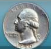
Pre-'65 Quarters $2.25* up to $400