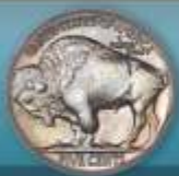
Buffalo Nickels 20¢* up to $2,700