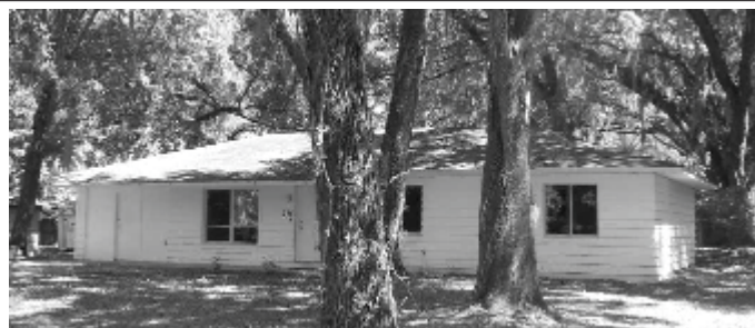
705 WILLARD AVE FRUITLAND PARK

Block 3 bedroom, 2 bath home on tree shaded lot. Central heat/air, inside laundry, storage/workshop, screened back porch. New paint throughout. Fenced back yard, paved driveway, fronting paved road. Close to City Hall, new Library, park and pool. Reduced - $117,500