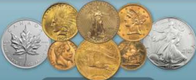
U.S. & Foreign Bullion Gold & Silver, & Platinum