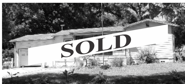
125 E. Lady Lake Blvd. LADY LAKE

Five acre parcel in Fruitland Park located just off Eagles Nest Rd. It is fenced with some cross fencing, electricity and water available. Good grass for your horse. Zoning for Site Built or Mobile Home. $80,000