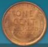
Wheat Cents 1.2¢* up to $2,500