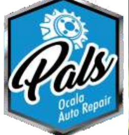
PALS Auto Repair hosted a Networking event for the Ocala Business Leaders, some

customers and friends. They gave a tour of their shop. There was entertainment, games, door prizes, great food and drink. The Ocala Business Leaders is a business networking group that has been inviting business people to breakfast on Wednesday morning for many years. They share information weekly. The club and the breakfast invitation is for open categories. One business per category. For more info call 804-1223.