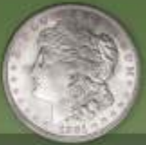
Morgan Dollars $11* up to $55,000