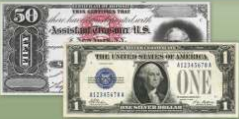
U.S. & Foreign Paper Money