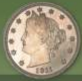
'V' Nickels 20¢* up to $1,300