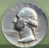
Pre-'65 Quarters $2.50* up to $400