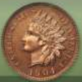
Indian Cents 20¢* up to $5,000