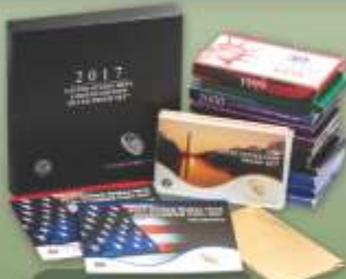
Proof & Mint Coin Sets