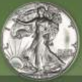
Walking Liberty Halves $5.00* up to $12,000