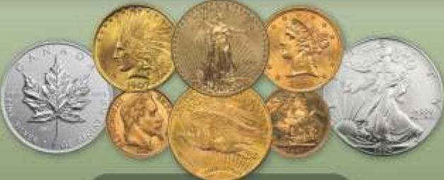
U.S. & Foreign Bullion Gold & Silver, & Platinum