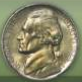
Silver War Nickels 20¢* up to $2,700