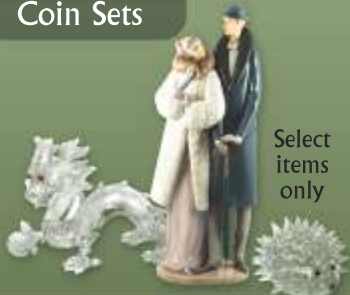
Swarovski & Lladro Figurines