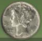
Mercury Dimes $1.00* up to $5,800