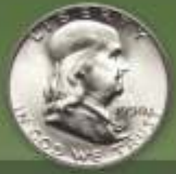
Franklin Half Dollars $5.00* up to $36