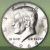
Pre-'65 Halves $5.00* up to $8