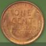
Wheat Cents 1.2¢* up to $2,500