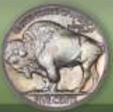
Buffalo Nickels 20¢* up to $2,700