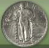
Standing Quarters $2.50* up to $2,800